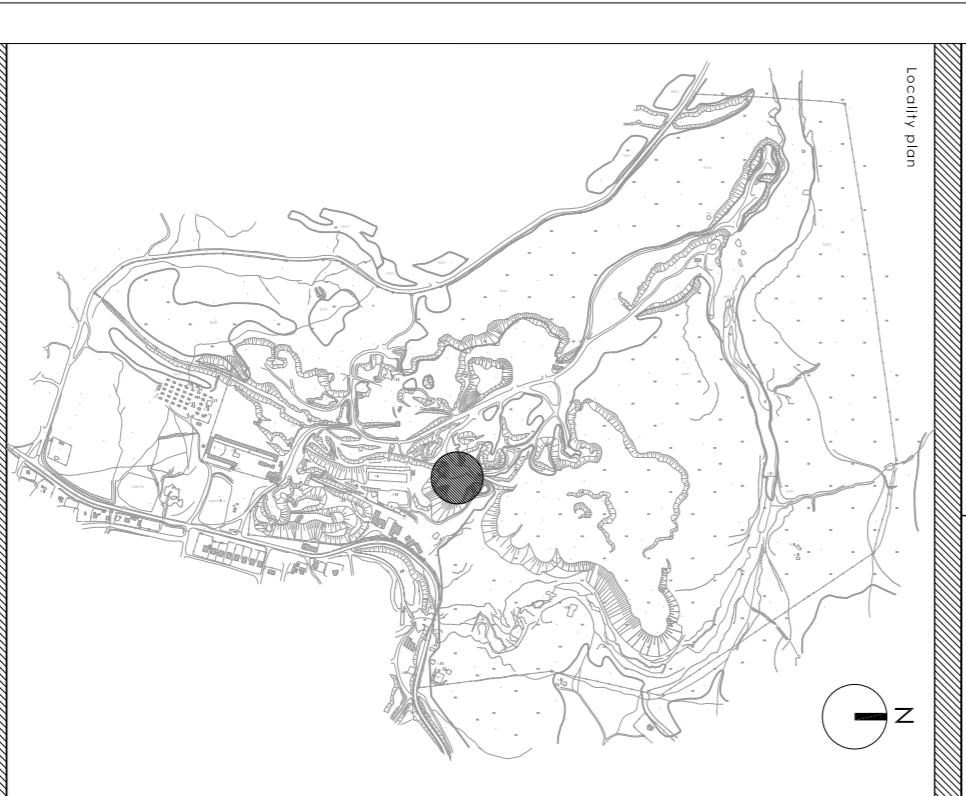
Taung skull heritage site THE MEMORIAL SITE FOR TENDER