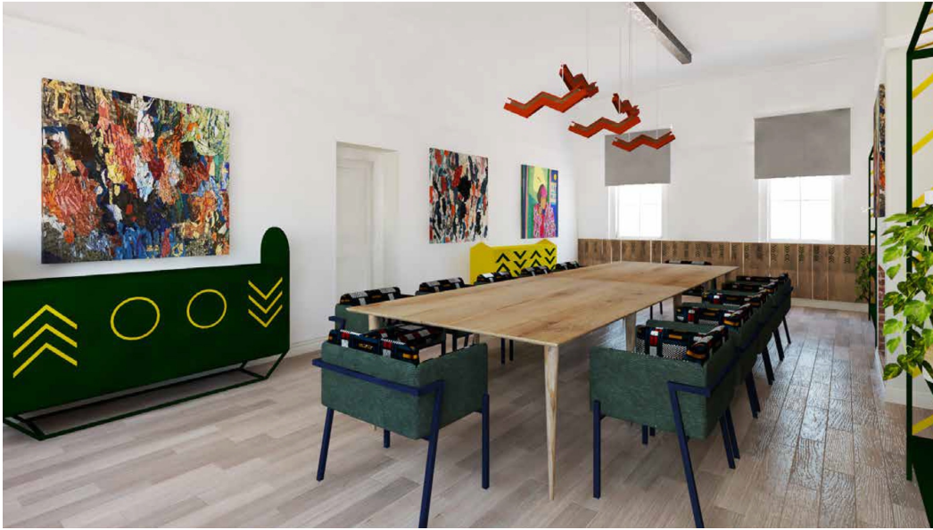
INTERIOR DESIGN RENDERS OF MEETING ROOM (by Safiso Shange AFRI MODERN) Note: Timber wall panels to be hung using a cleat fixing system