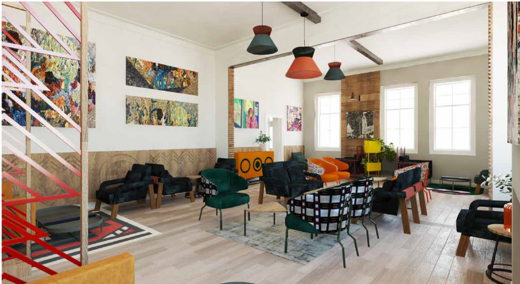
INTERIOR DESIGN RENDERS OF EVENT ROOMS 1 AND 2 (by Safiso Shange AFRI MODERN) Note: Edge of cut line of new opening is clearly demarcated.