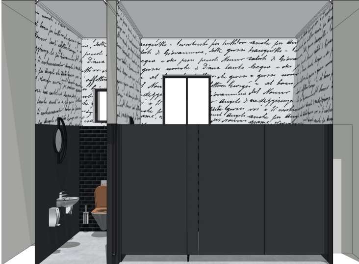
INTERIOR DESIGN RENDER OF ABLUTIONS (by Glorinah Mabaso)

Note: Vitrex partitions are raised above the floor with steel legs. The wall design is hand painted text with thoughts and names of ex-prisoners.