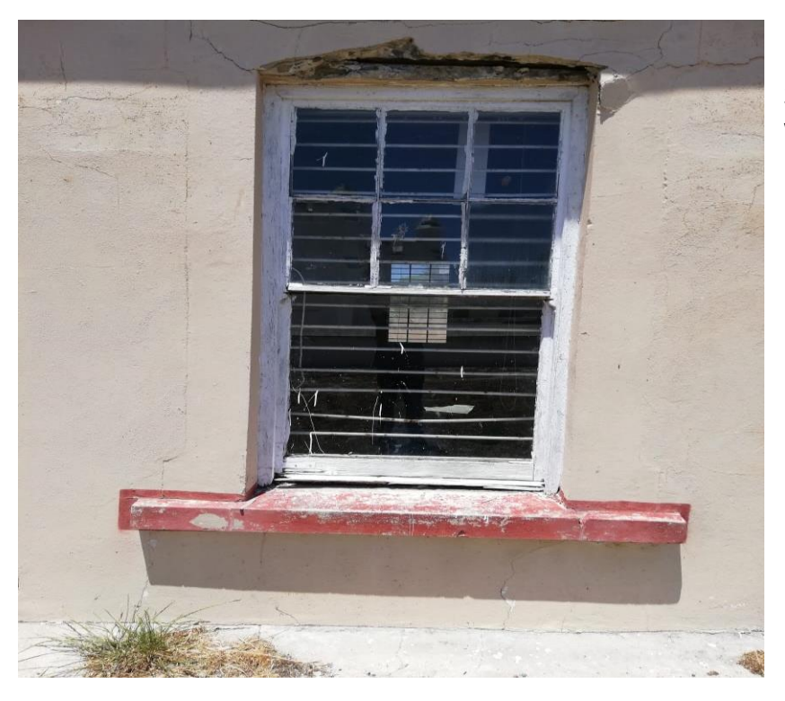
3. Repair all broken window revels & lintel work