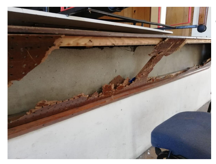
1. Replace under counter cover board & Vanish