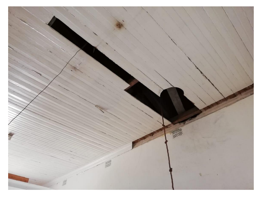
2. Repair damaged ceiling & cornice