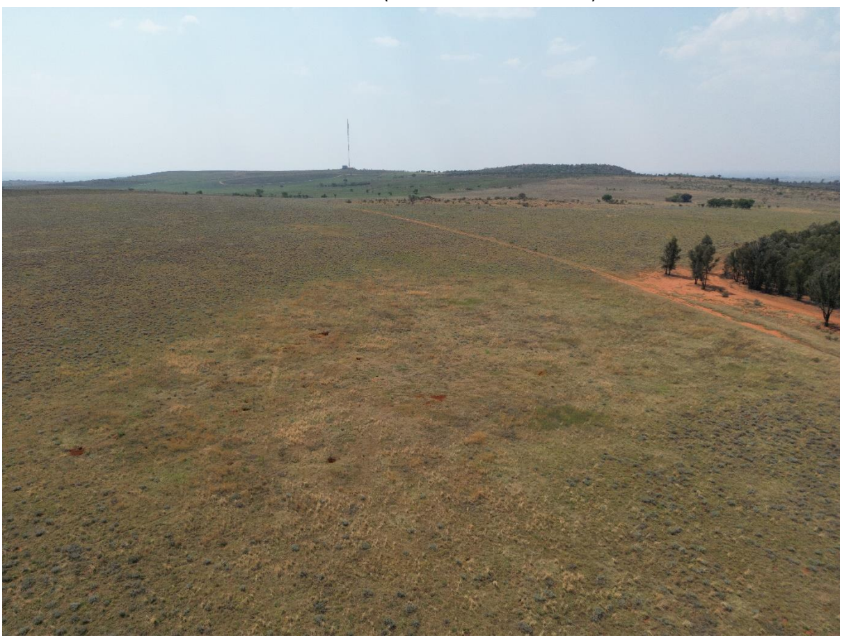
Plate 1: The site (taken towards the north)