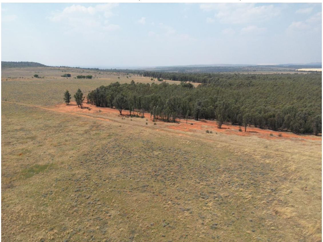
Plate 2: The site (taken towards the north east)