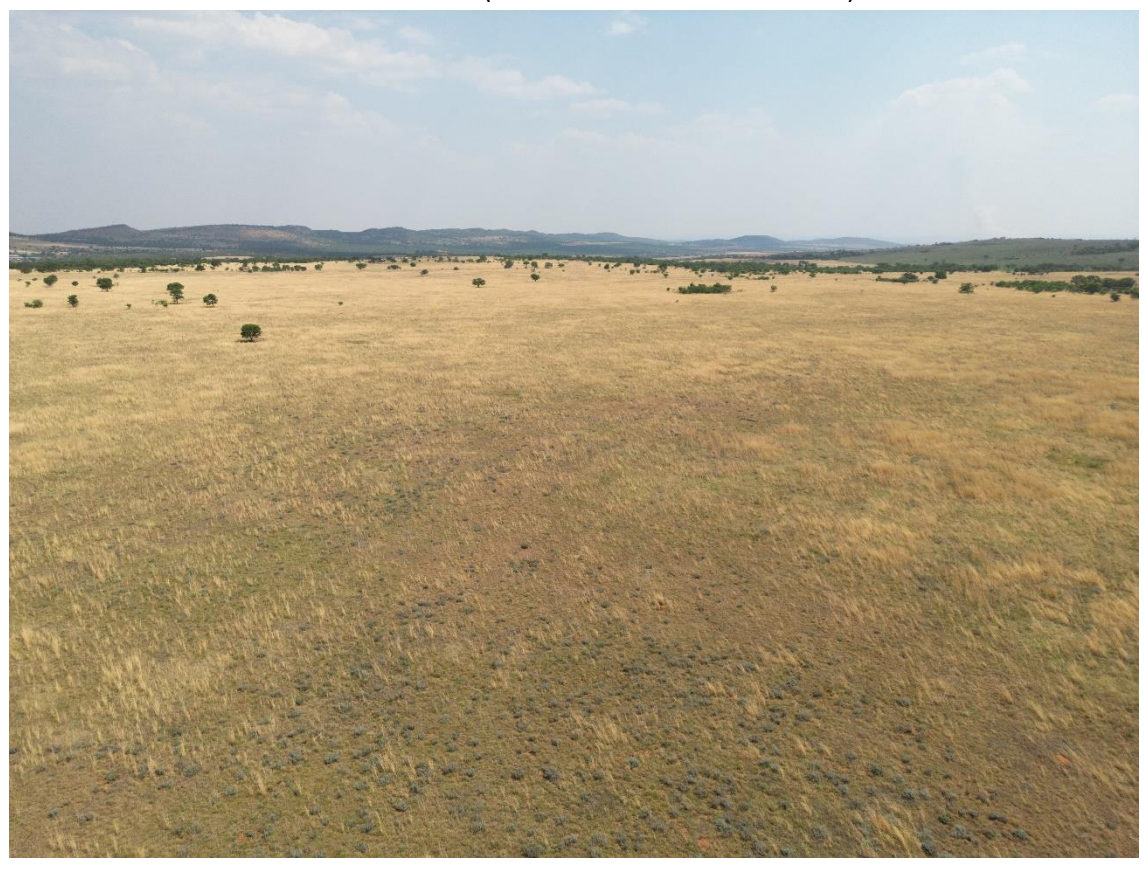
Plate 7: The site (taken towards the west).