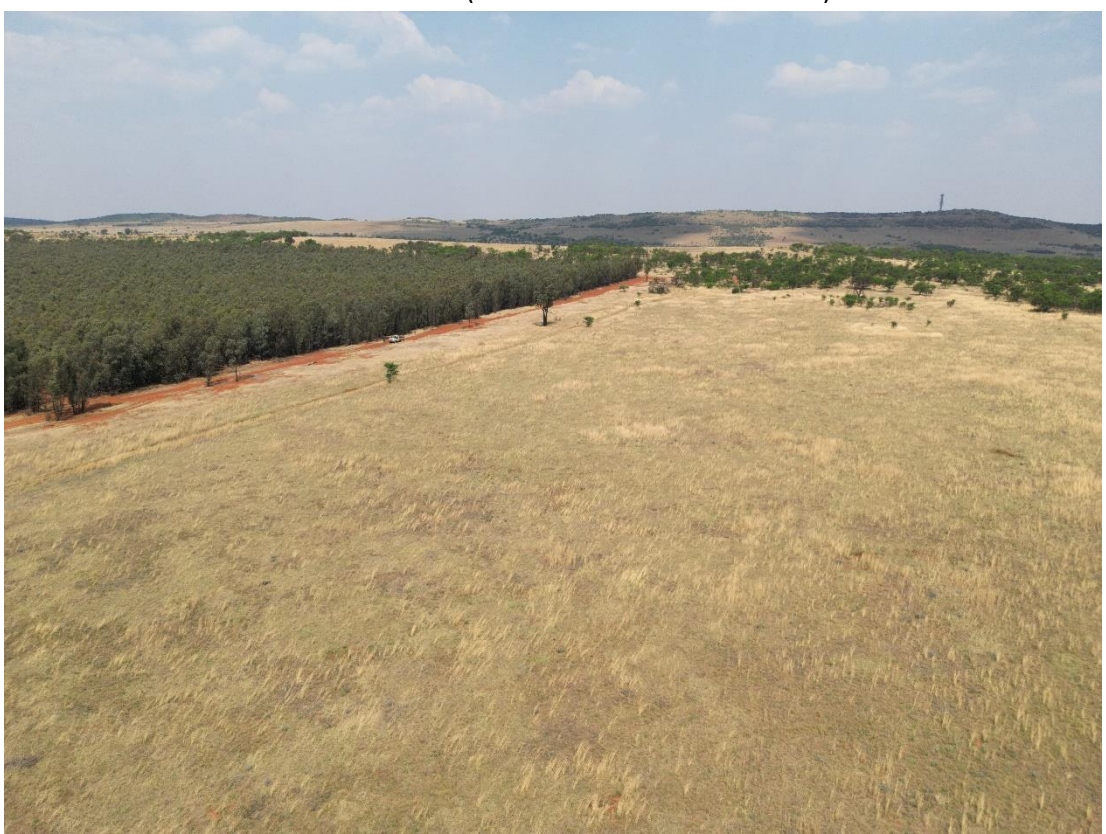
Plate 4: The site (taken towards the south east).