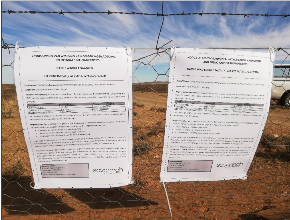
Figure 1: Site Notice placed at entrance gate of the Remaining Extent of Portion 0 of Farm 8 (Knapdaar).

Co-ordinates: 30°39'22.02"S / 24°22'37.59"E