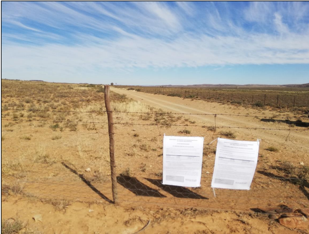
Figure 3: Site Notice placed at Portion 12 of Farm 165 (Vendussie Kuil)

Co-ordinates: 30°34'43.47"S / 24°17'9.74"E