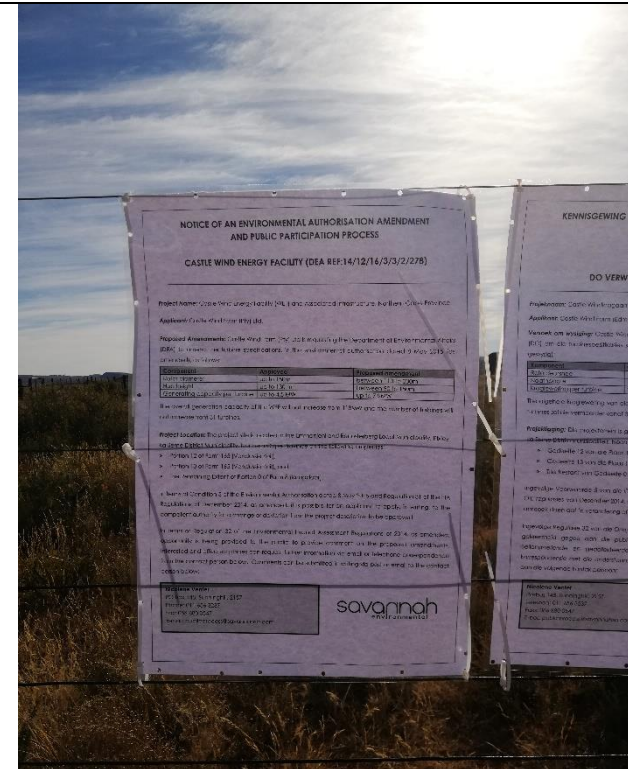
Figure 4: Site Notice placed at along the unnamed gravel road leading up to the entrance gate of the Remaining Extent of Portion 0 of Farm 8 (Knapdaar).

Co-ordinates: 30°34'43.47"S / 24°17'9.74"E