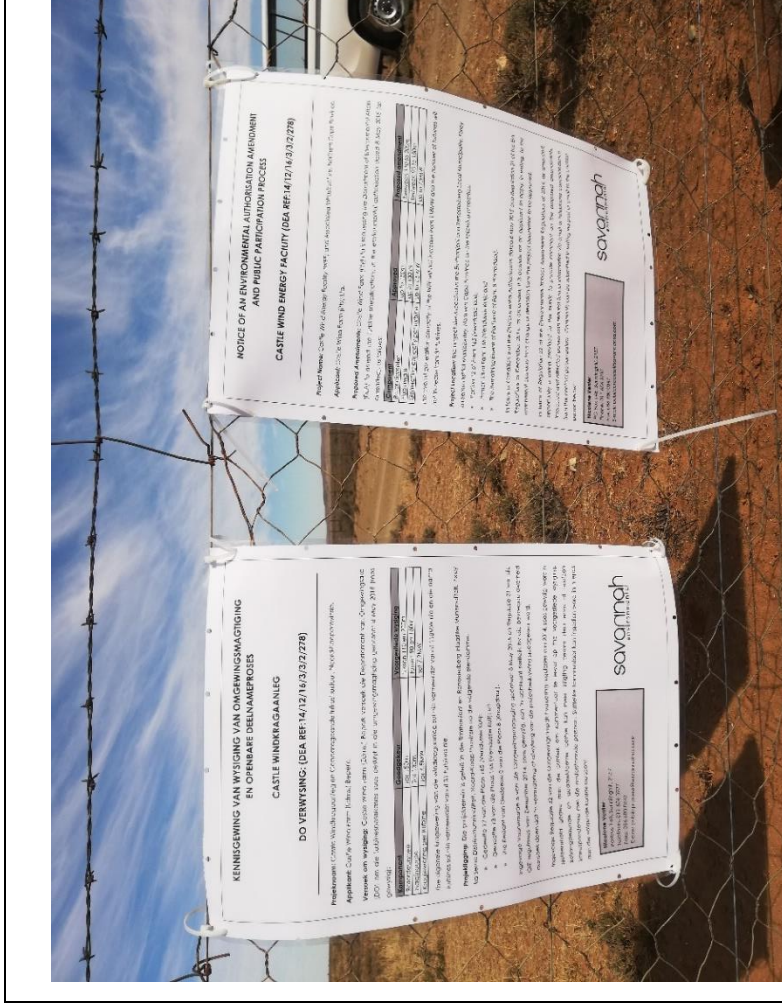
Figure 1: Site Notice placed at entrance gate of the Remaining Extent of Portion 0 of Farm 8 (Knapdaar).

Co-ordinates: 30°39'22.02"S / 24°22'37.59"E