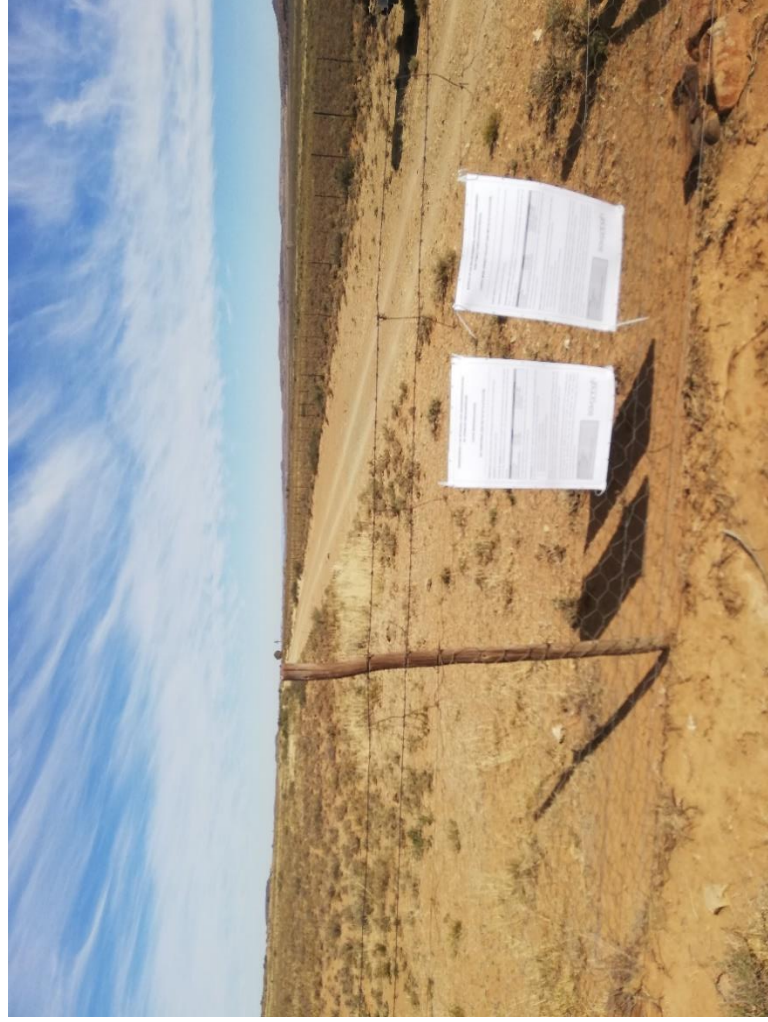
Figure 3: Site Notice placed at Portion 12 of Farm 165 (Vendussie Kuil)

Co-ordinates: 30°34'43.47"S / 24°17'9.74"E