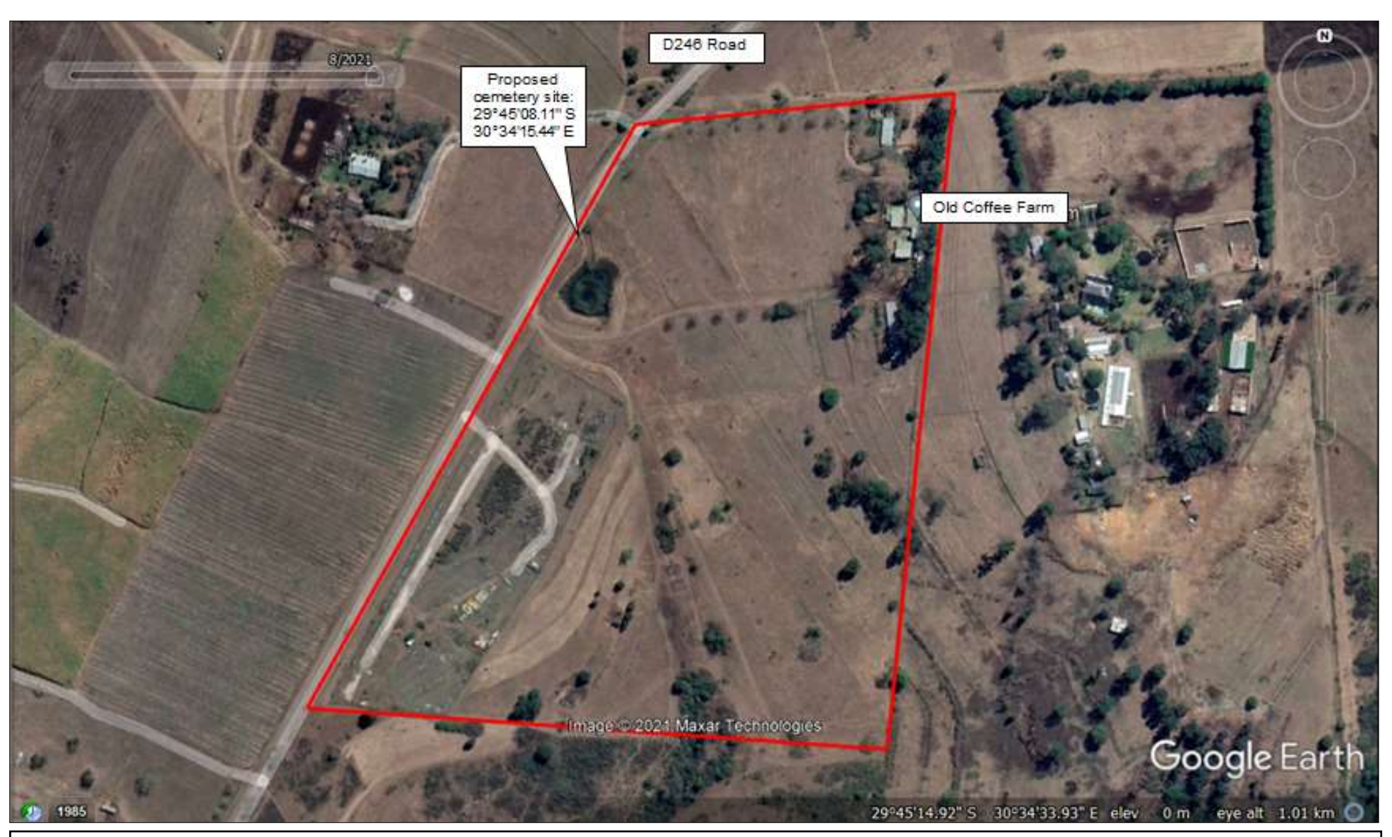
Figure 2: Map showing the proposed cemetery site, Cato Ridge, KwaZulu-Natal.