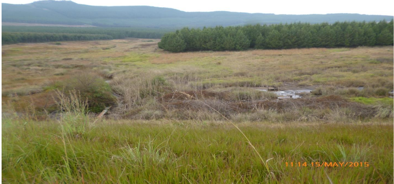
FIGURE 3 – 6 PHOTOGRAPHS OF PROPOSED PROJECT AREA AND DAM.