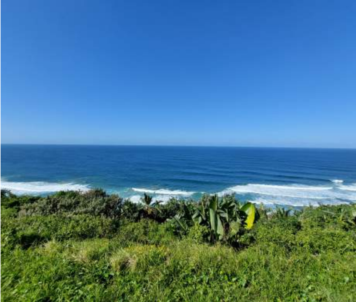
Figure 01 : Indian Ocean Viewpoint