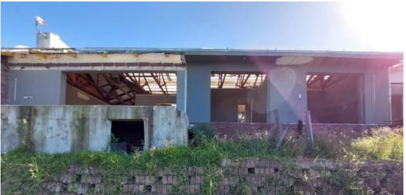
Figure 37 : 627+629 Marine Drive