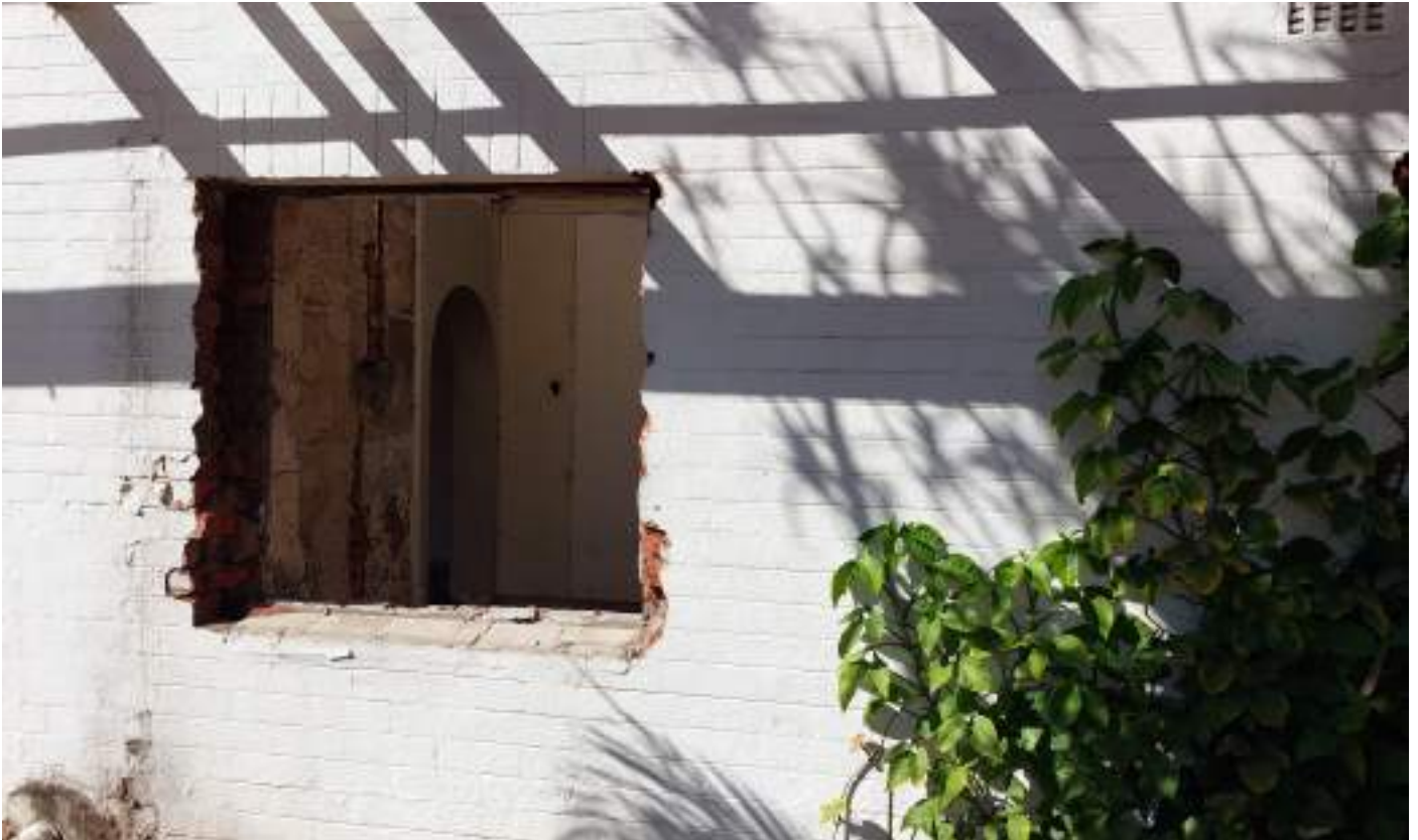
Figure 30 : 627+629 Marine Drive