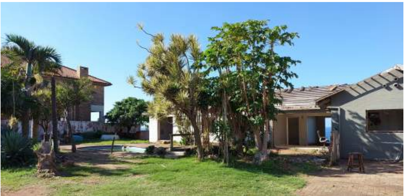
Figure 25 : 627+629 Marine Drive