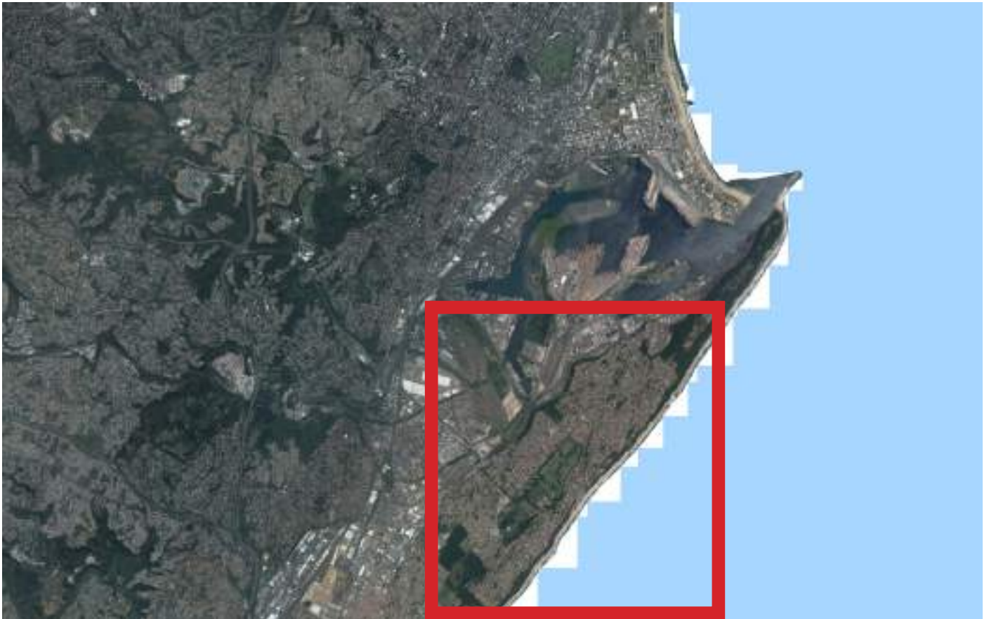
Figure 04 : Macro Analysis Bluff View

In conclusion, Bluff, Durban, offers a vibrant residential community with stunning coastal views, a diverse population, and access to various amenities and recreational opportunities. With its distinct geography and close-knit community, Bluff continues to be an attractive neighborhood for individuals and families seeking a coastal lifestyle within reach of the city.