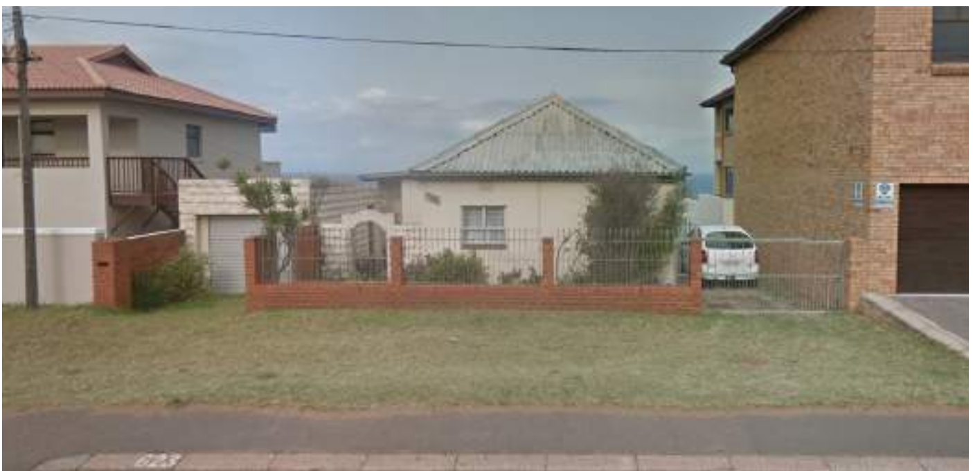
Figure 07 : 623 Marine Drive