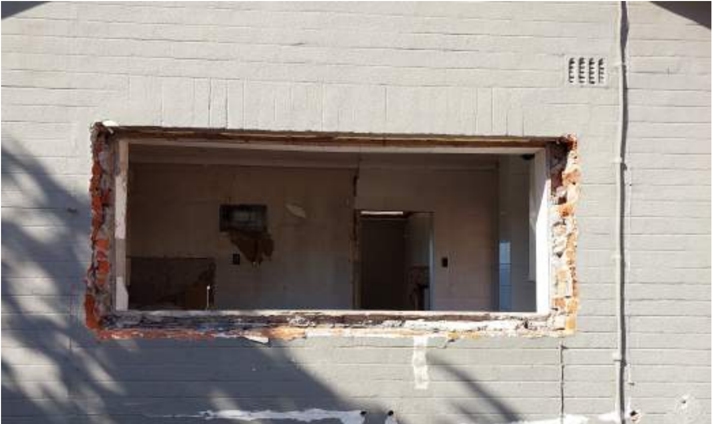
Figure 26 : 627+629 Marine Drive