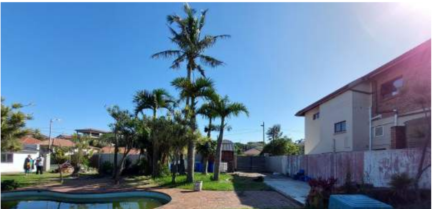
Figure 33 : 627+629 Marine Drive