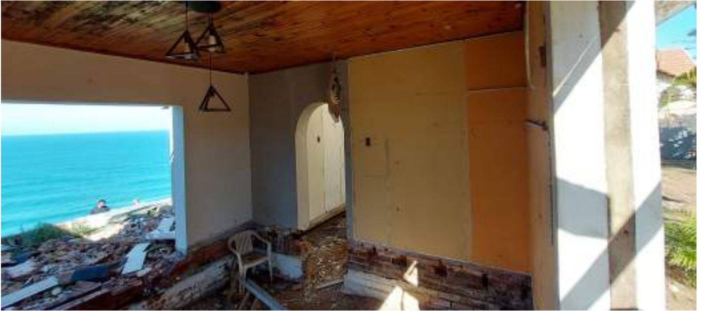
Figure 32 : 627+629 Marine Drive