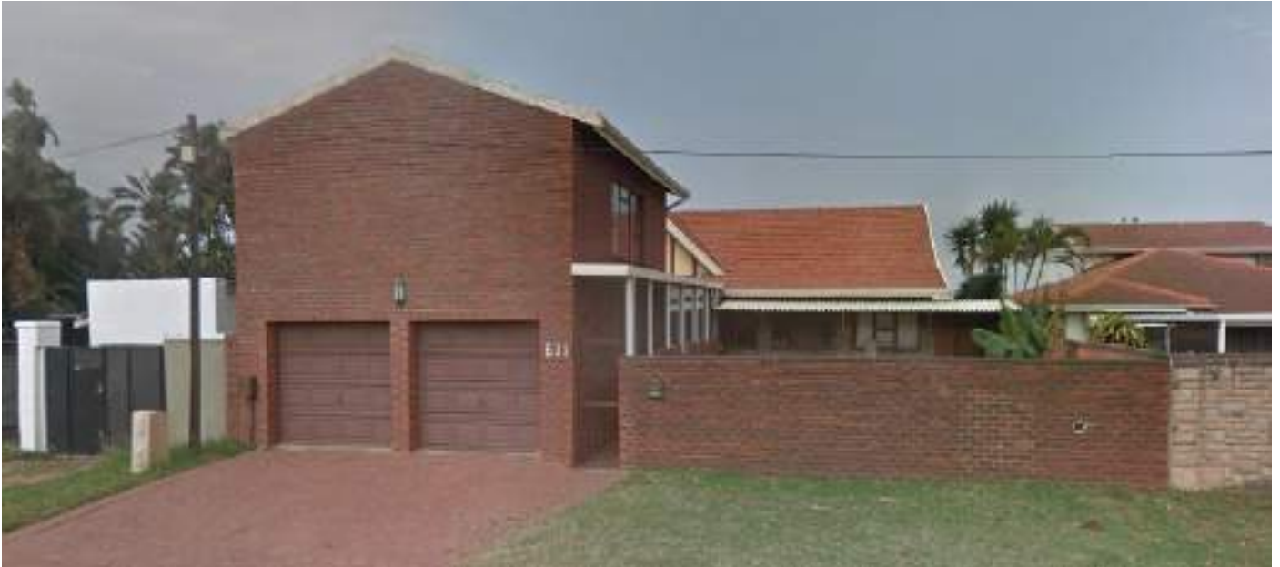
Figure 12 : 631 Marine Drive