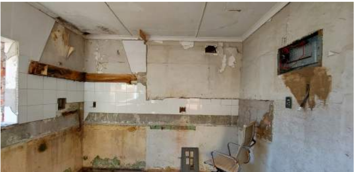
Figure 39: 627+629 Marine Drive