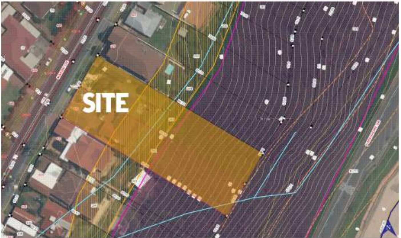
Figure 03 : Micro Analysis Site View

The site slope faces east and is protected by DMOSS on the lower flanks. The site consists of protected indigenous plant life, non developable area and bluff slope slip areas. These geological constraints are important and inform the design as the main architectural control generator. Therefore careful consideration is implemented in forming the Proposed New family house design such that it respects all controls, inclusive of building lines, coverage, non developable areas and potentially unstable soil.