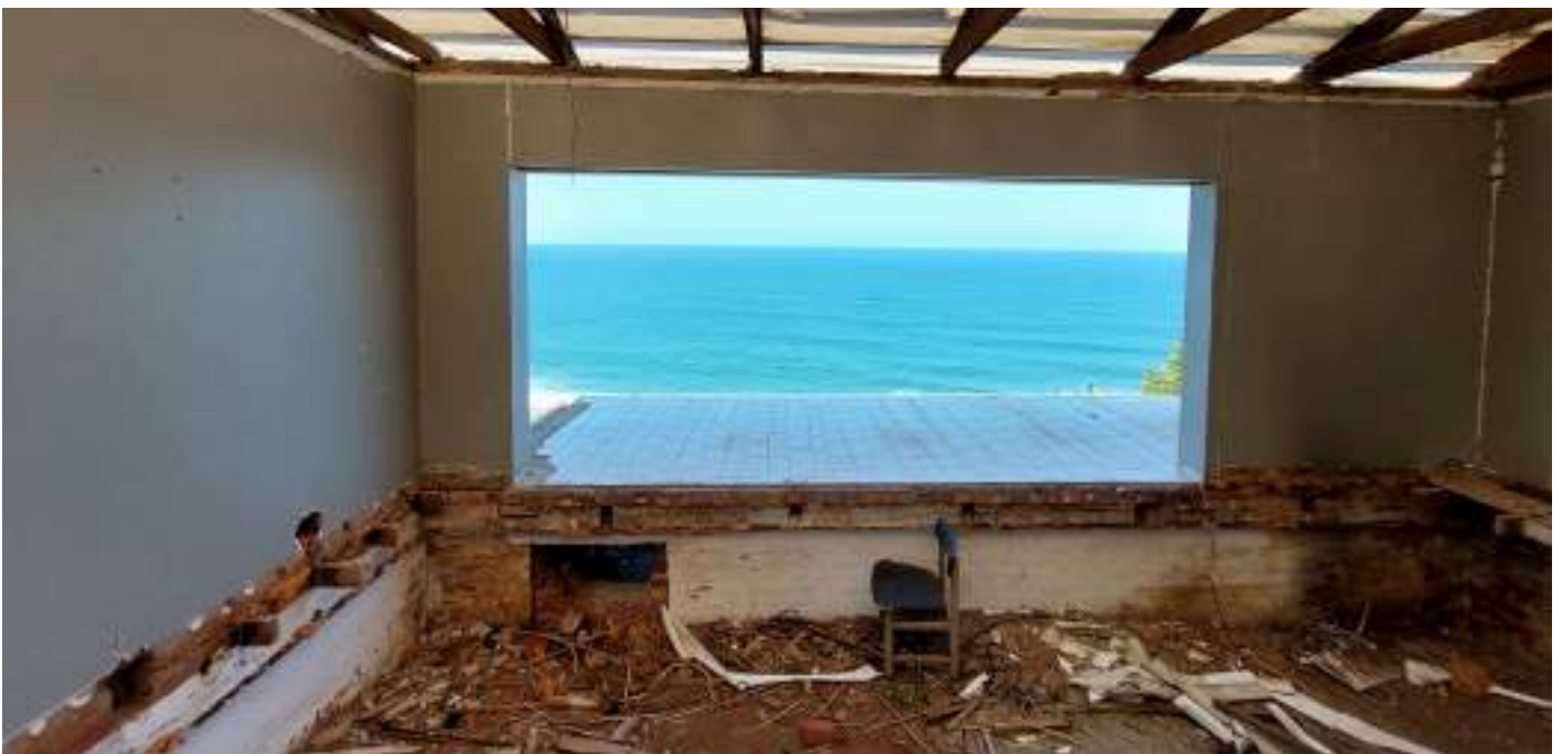
Figure 29 : 627+629 Marine Drive