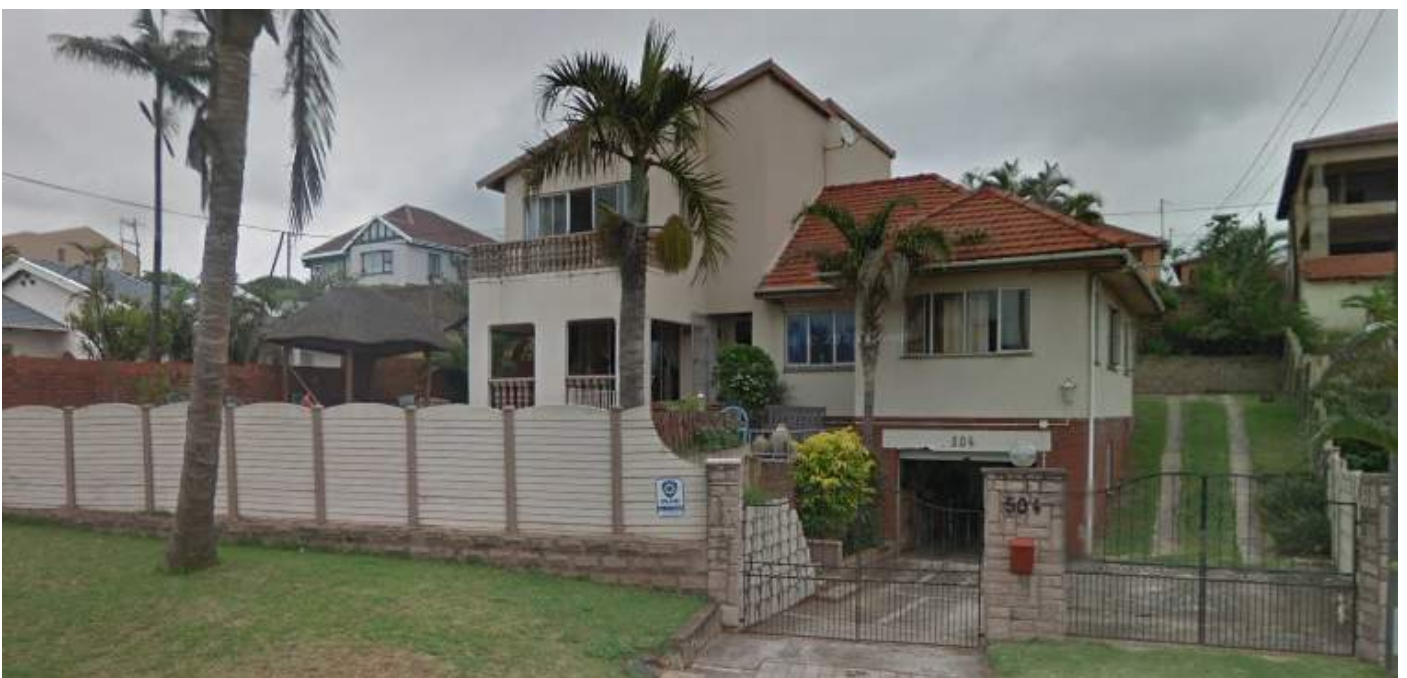
Figure 23 : 504 Marine Drive