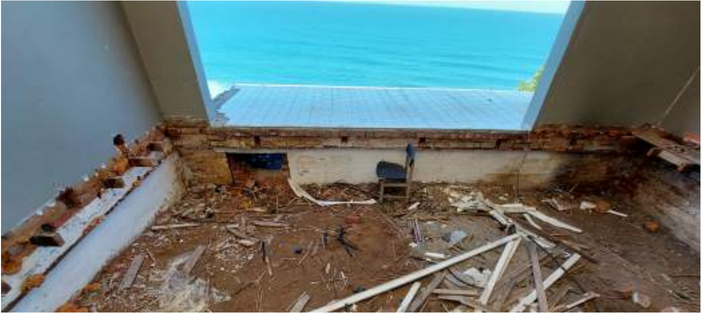
Figure 28 : 627+629 Marine Drive