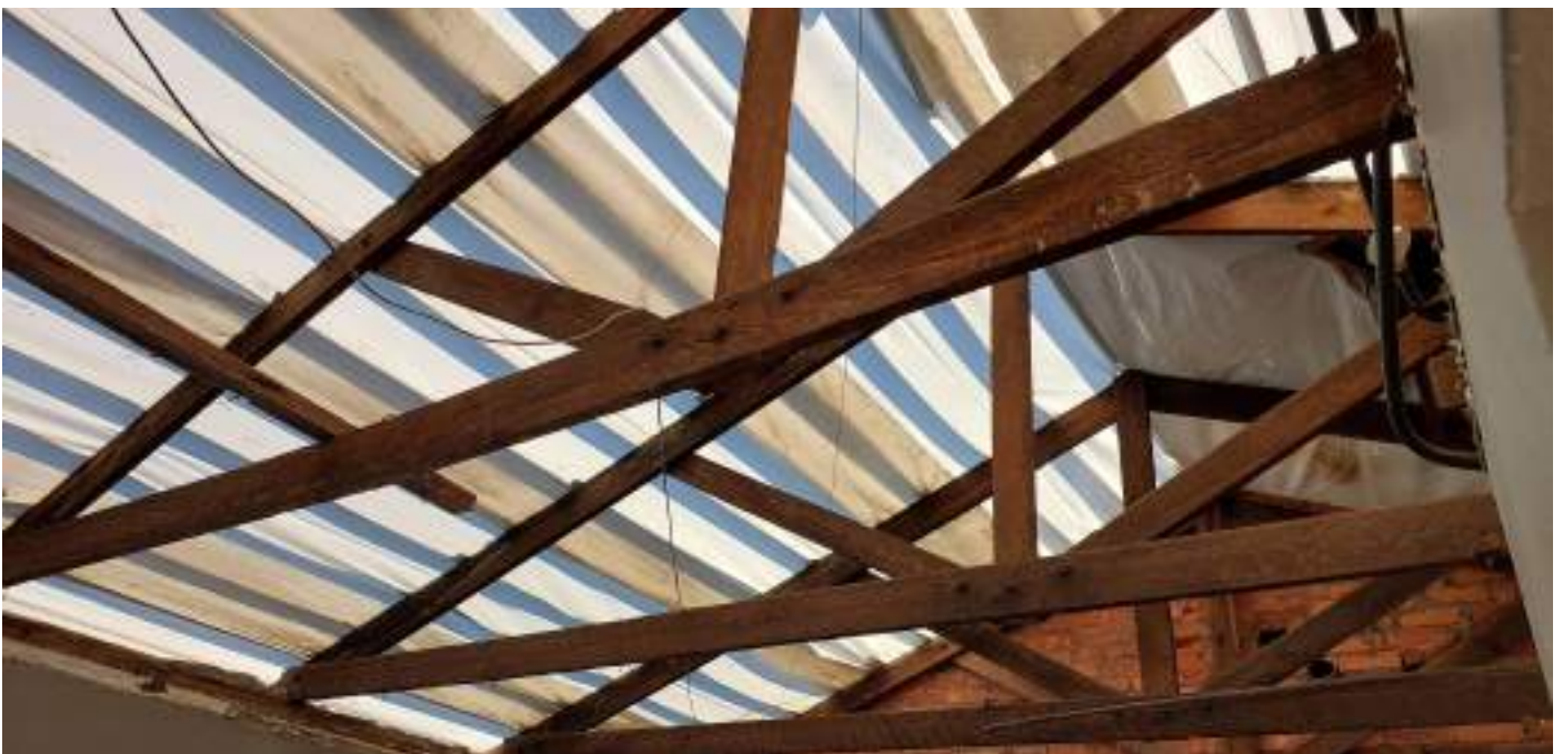
Figure 27 : 627+629 Marine Drive