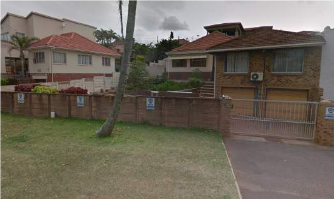
Figure 22 : 502 Marine Drive