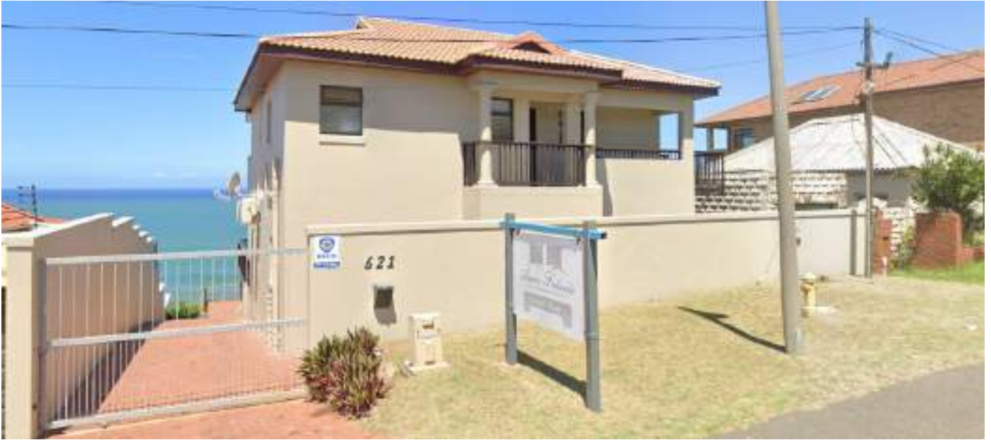
Figure 08 : 621 Marine Drive