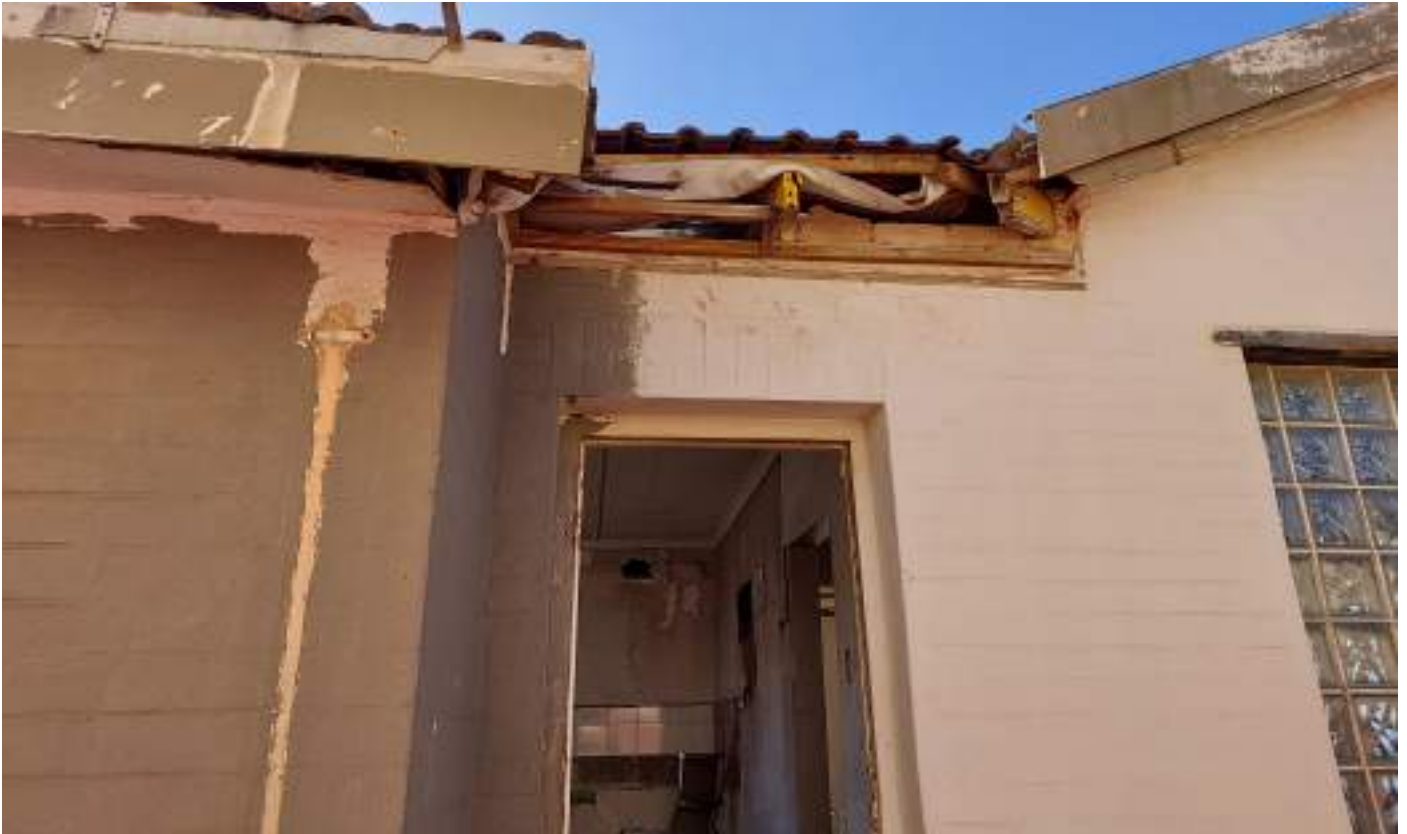
Figure 38 : 627+629 Marine Drive