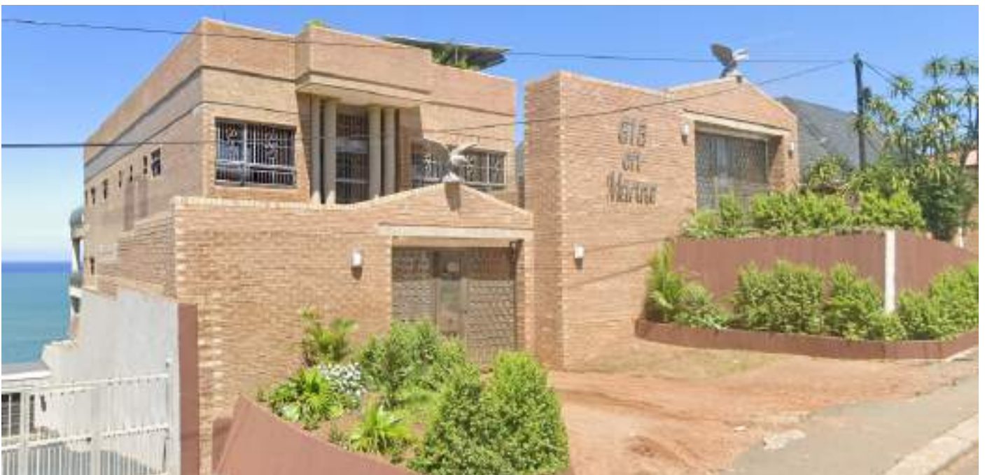
Figure 11 : 615 Marine Drive