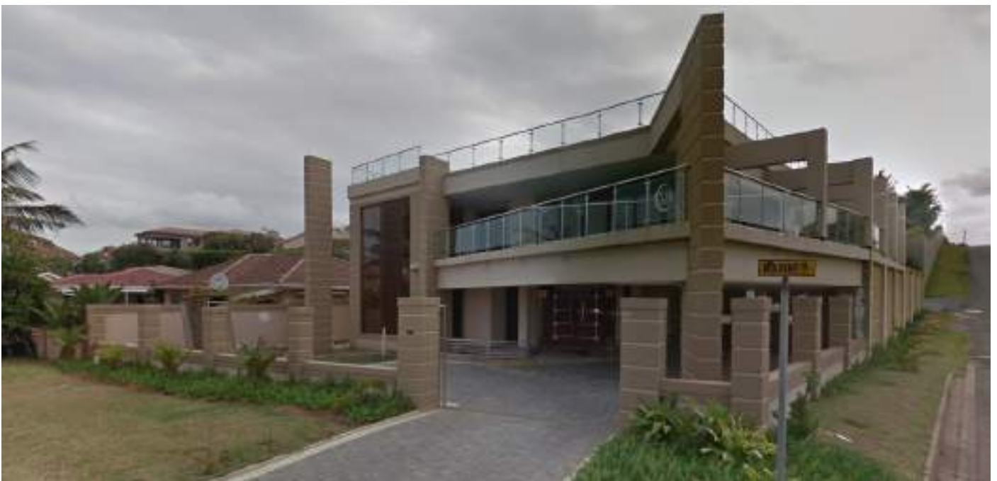
Figure 17 : 492 Marine Drive