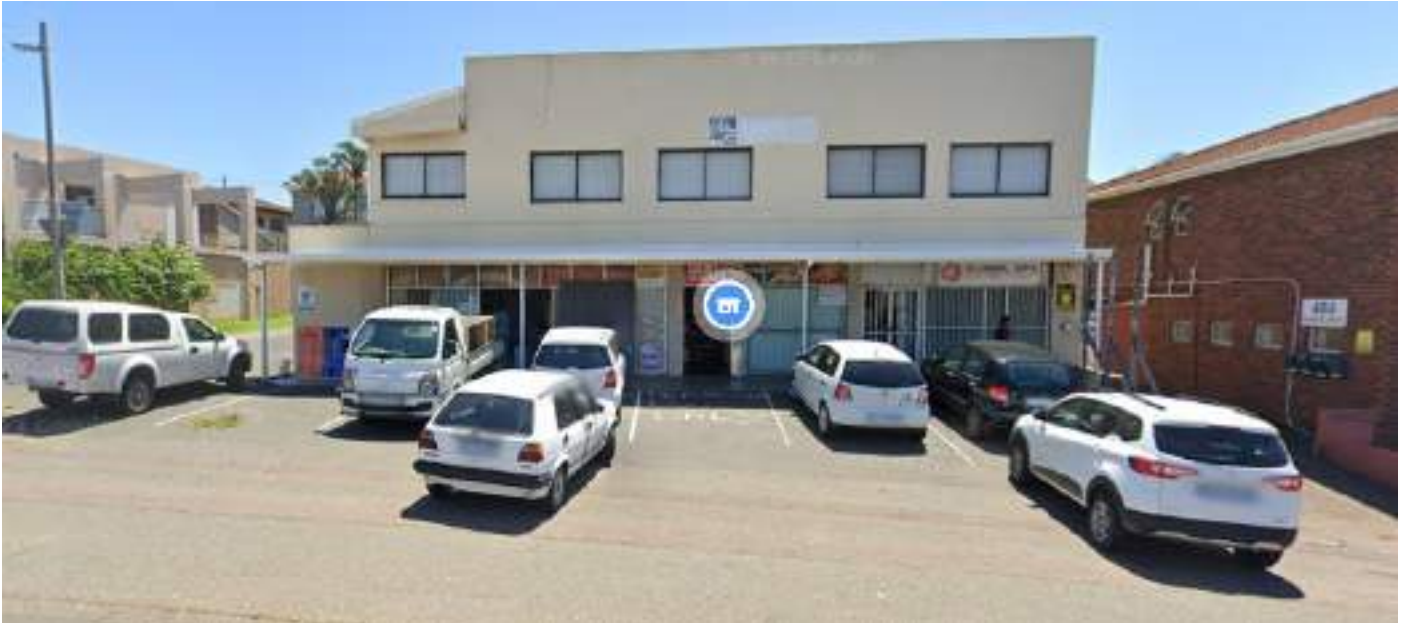
Figure 16 : 488 Marine Drive