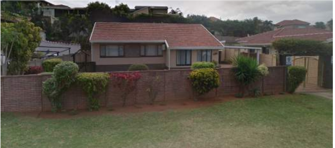
Figure 20 : 498 Marine Drive