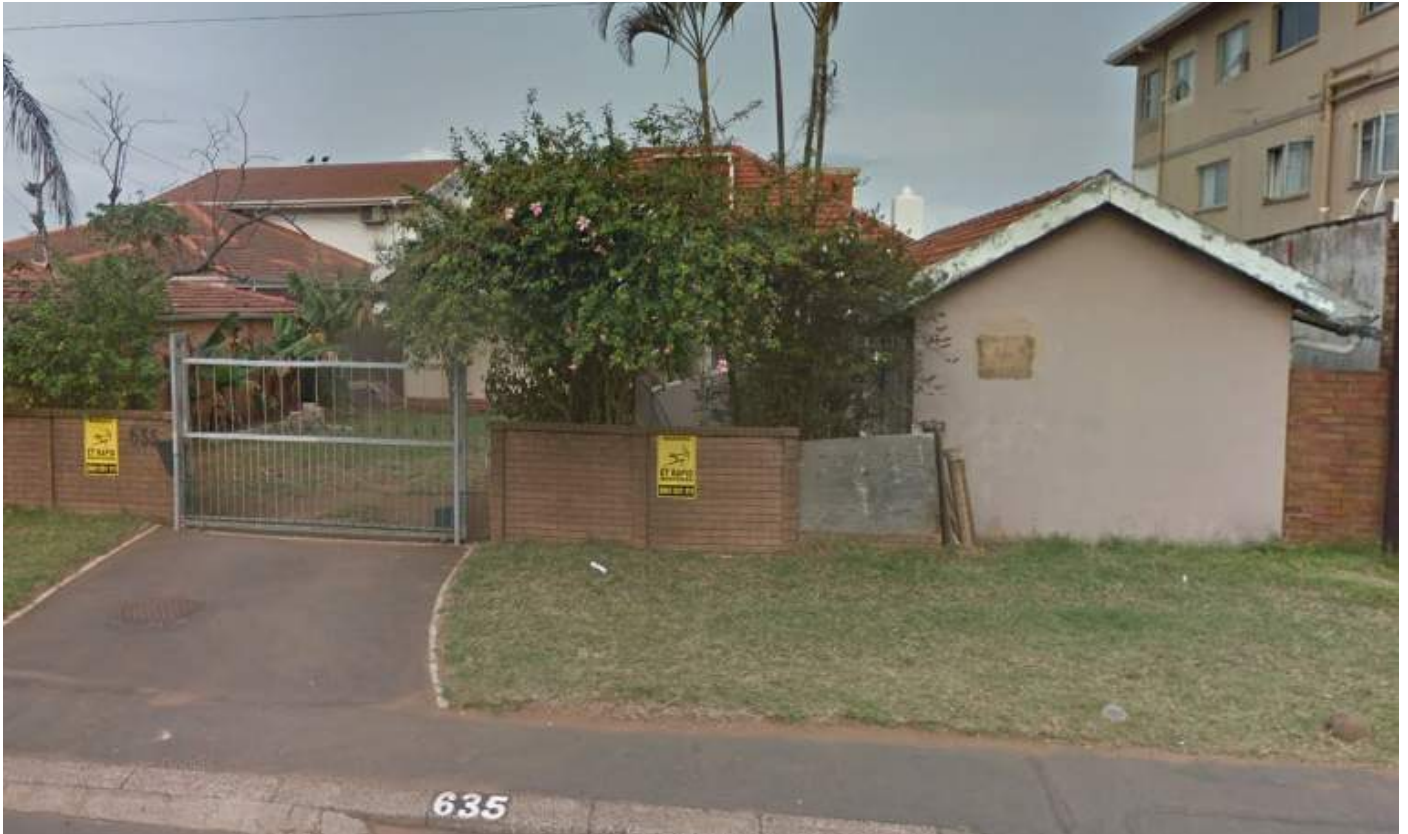
Figure 14 : 635 Marine Drive