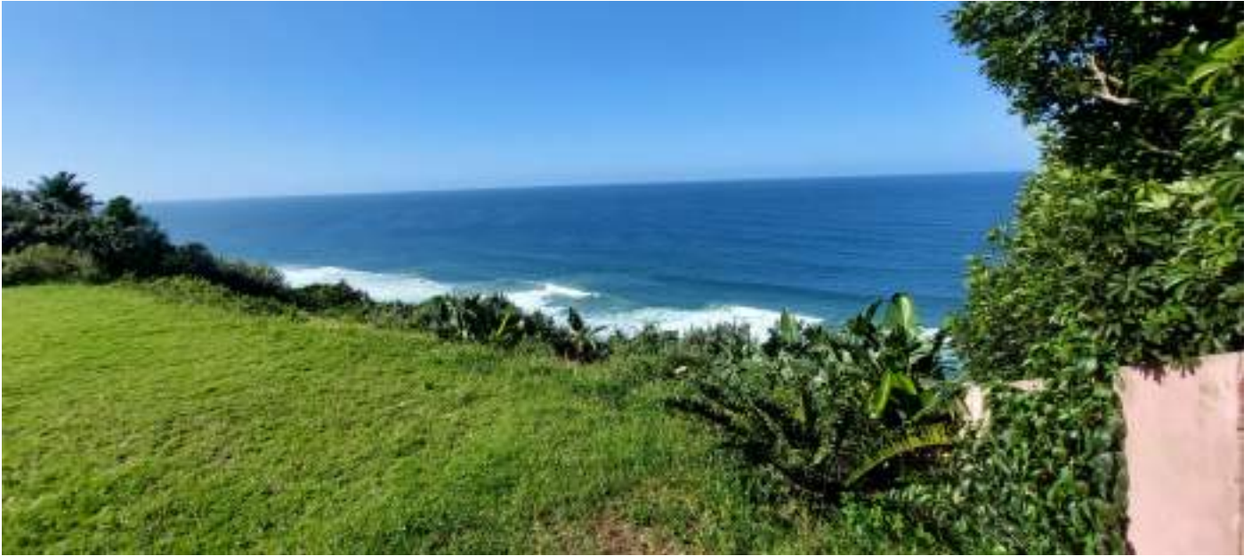
Figure 36 : 627+629 Marine Drive