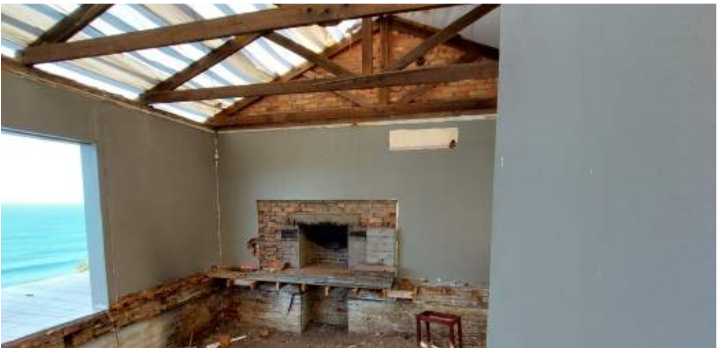
Figure 31: 627+629 Marine Drive