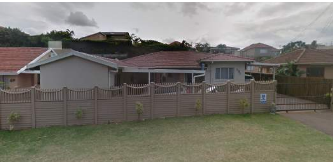
Figure 19 : 496 Marine Drive