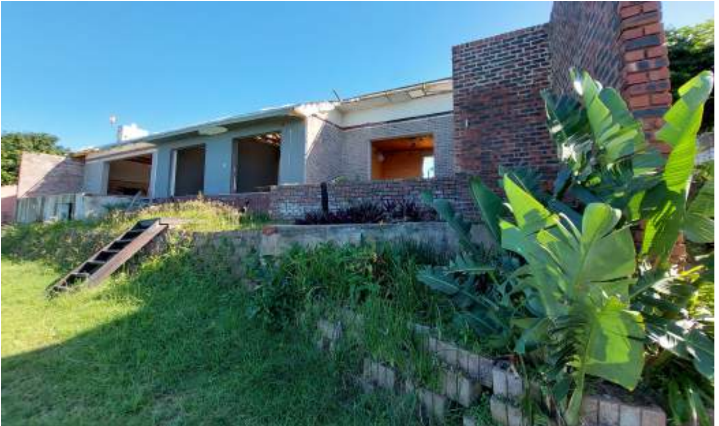
Figure 34 : 627+629 Marine Drive