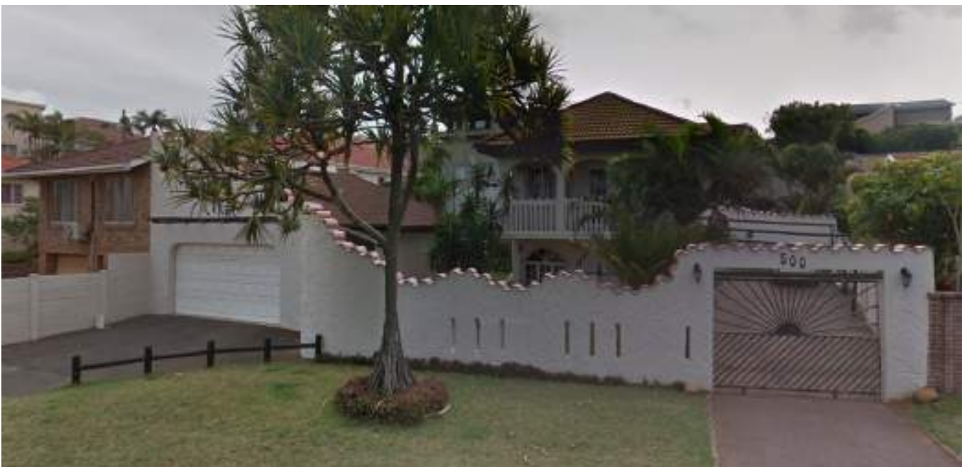
Figure 21 : 500 Marine Drive