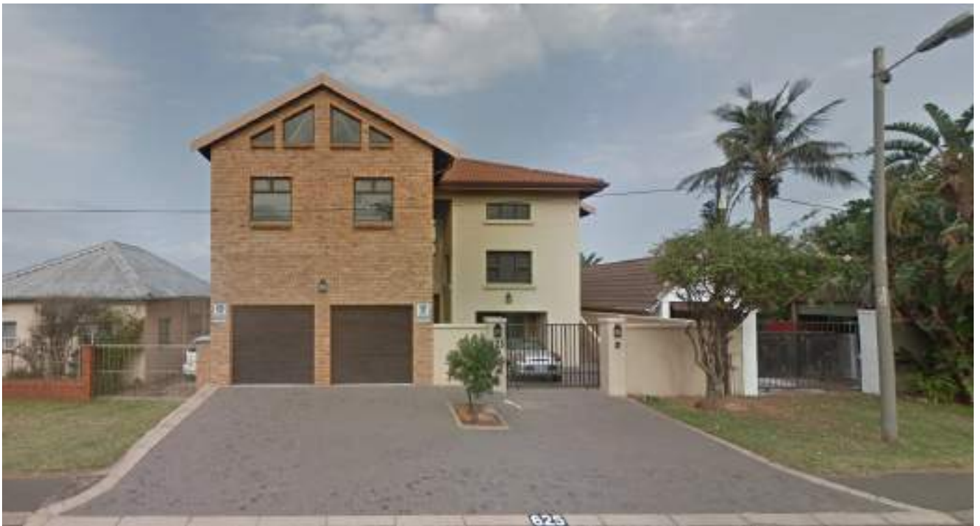
Figure 06 : 625 Marine Drive