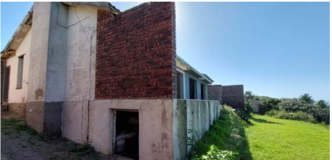
Figure 35: 627+629 Marine Drive