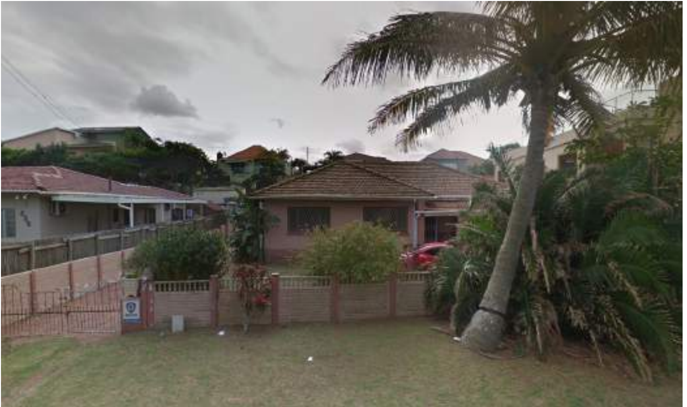
Figure 18 : 494 Marine Drive