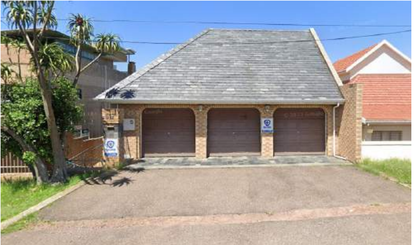
Figure 10 : 617 Marine Drive