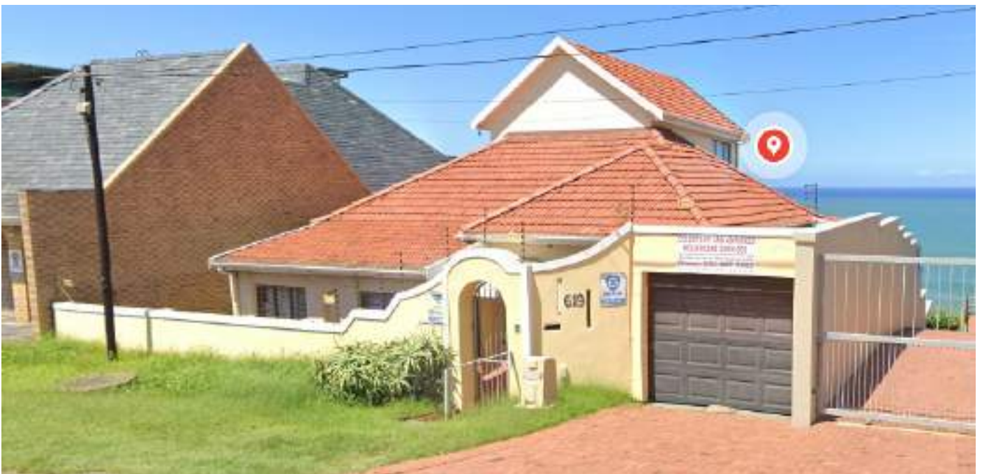
Figure 09 : 619 Marine Drive