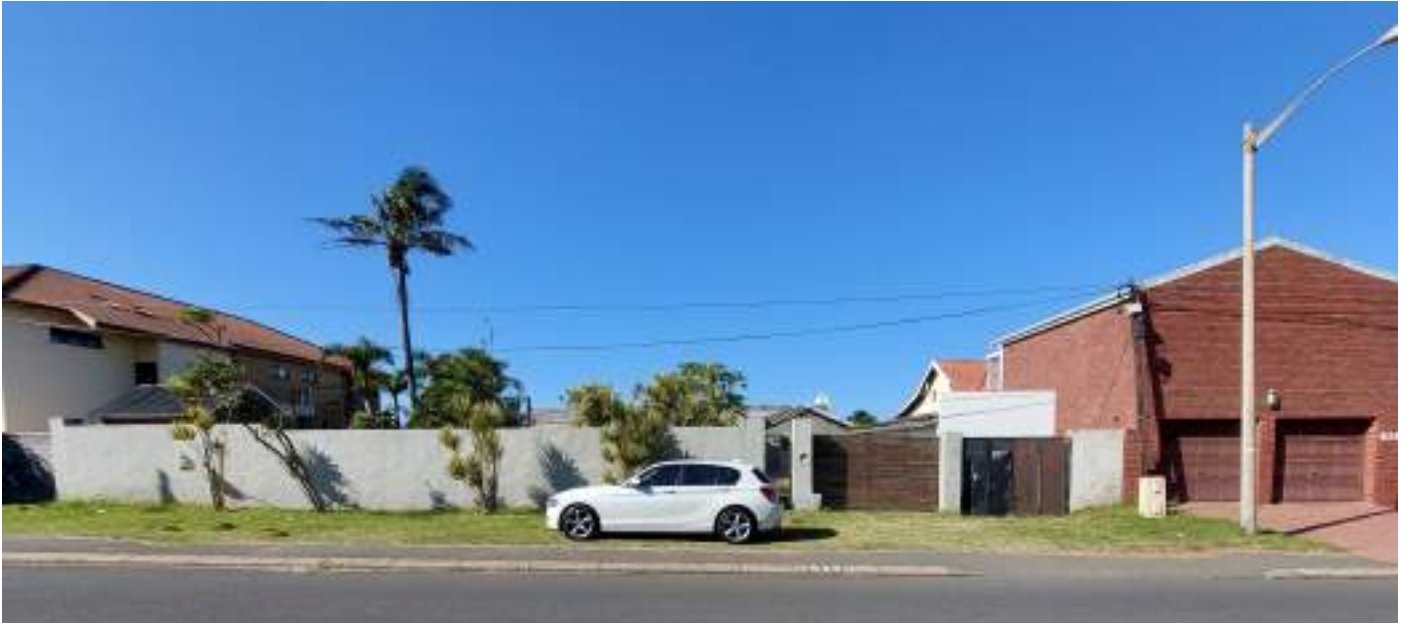
Figure 24 : 627+629 Marine Drive