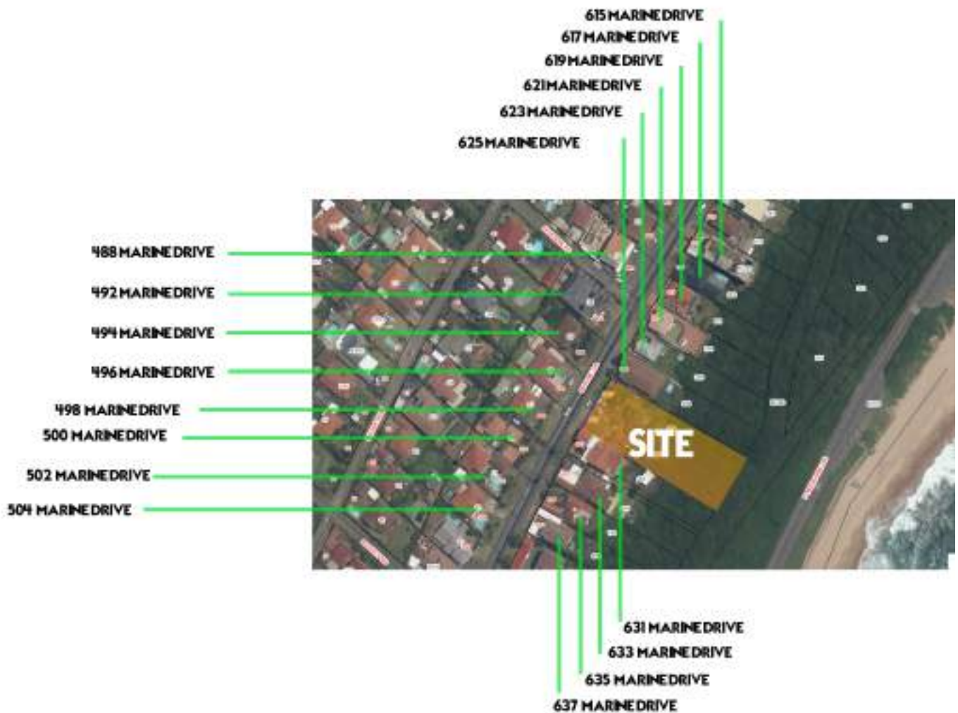
Figure 05 : Micro Analysis Site View