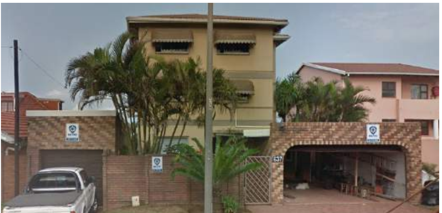
Figure 15 : 637 Marine Drive