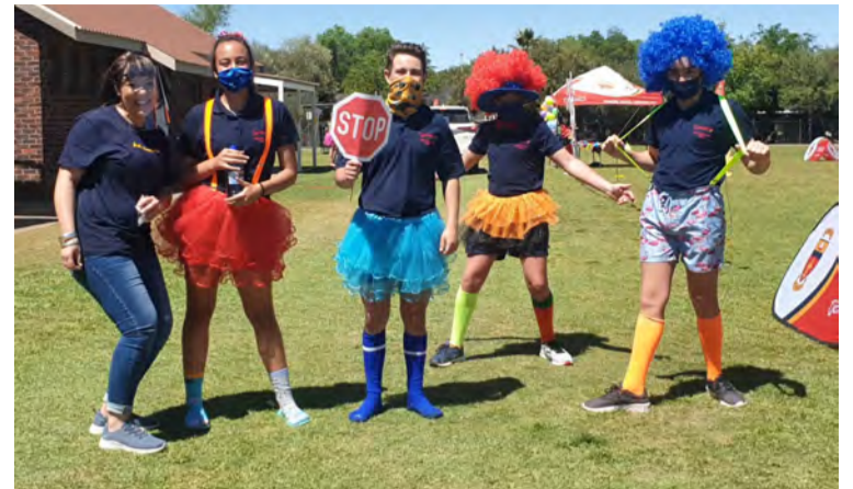
Van die leerders en 'n onderwyser wat voornemende Tjokkies en hul ouers verwelkom het.

was en het daar lekker interaksie met die nuwe ouers en die nuwe Tjokkies plaasgevind het; iets wat in die verlede effens ontbreek het. Met hierdie dag kon elke ouer en kind die nuwe onderwysers van aangesig tot aangesig ontmoet."