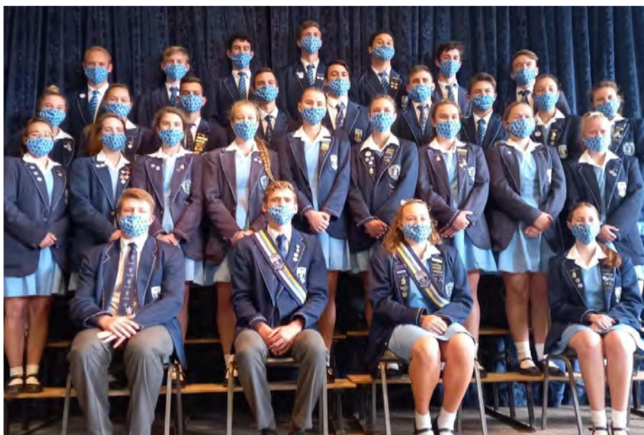
Die Hoërskool Fichardt se leerderraad van 2021 het onlangs hulle leerderraad-baadjies ontvang.

besef nie dat hulle eintlik op pad is groot skool toe nie omdat die jaar soveel onderbrekings gehad het." Dit is 'n dag wat die kleintjies nie sommer gou sal vergeet nie. Gunter sê dat die skool beslis soortgelyke dae in die toekoms sal oorweeg.