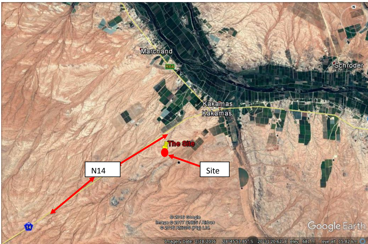
Figure 1: Aerial image showing the location of the proposed site (red dot) and the surrounding area.

The site co-ordinates are 28°46'36.24"S, 20°30'41.41"E.