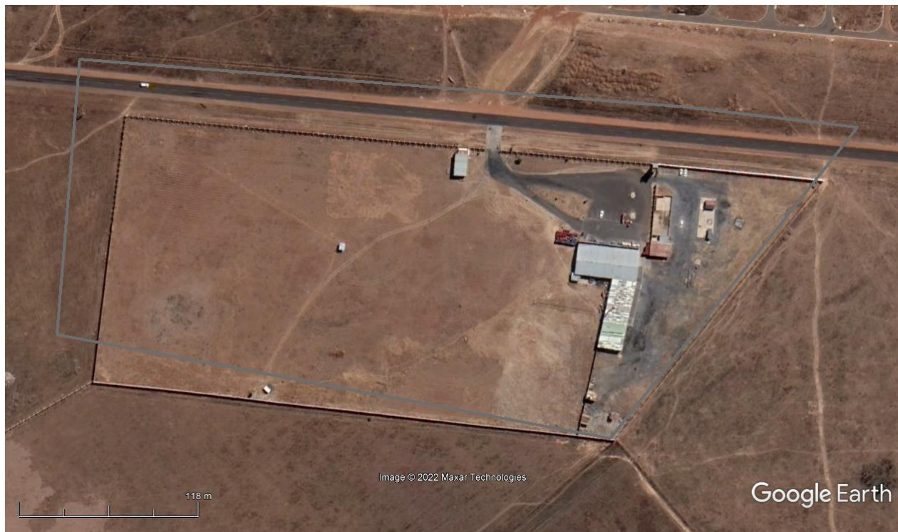
Figure 5: Google Earth image indicating the site.

In light of these factors, the chances of finding any heritage related features are indeed extremely slim, if any. This letter serves as an exemption request to the relevant heritage authority.