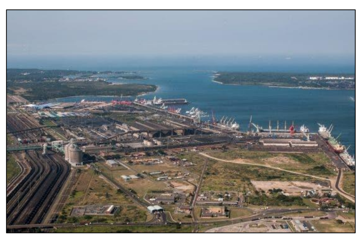
Figure 1: Photograph showing the Port of Richards Bay, KwaZulu-Natal.

The proposed project is of utmost national strategic importance as it forms part of National Government's intent to address the debilitation economic impacts of both the energy crisis as well as the COVID-19 pandemic on the country. The Richards Bay Port was identified as a preferred location as it meets the specifications for the proposed powership project and occurs within a close proximity to the Richards Bay Industrial Development Zone (RBIDZ) (Figure 1 and 2 below).