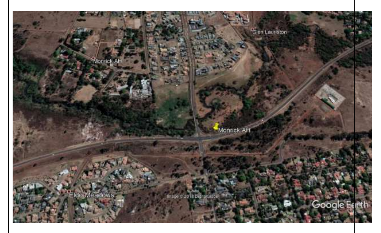
Figure 1: Location map

In the event that no alternative(s) has/have been provided, a motivation must be included in the table below.