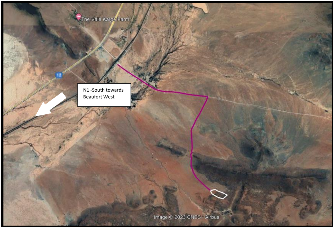
Figure 1: Satellite view of the proposed mining permit area (white polygon) of Otter Mist Trading 1057 (Pty) Ltd (image obtained from Google Earth)

A total of 33 alien plant species have been recorded within the extracted area, with 9 of them being listed invasive species within the NEM:BA A&IS Regulations, namely: