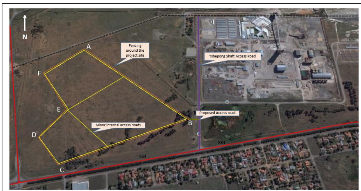
Figure 2: Map indicating access roads for the preferred site layout of the proposed PV Solar Facility

Include the position of the access road on the site plan and required map, as well as an indication of the road in relation to the site ( Refer to Figure 2 and Figure 3 ).