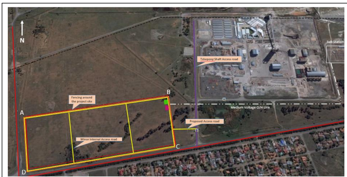
Figure 3: Map indicating access roads for the alternative site layout of the proposed PV Solar Facility