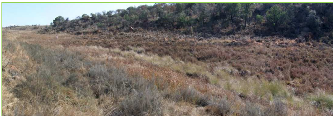
Plate A: A large, seasonal wetland identifiable by the characteristic flora. This wetland contained no surface water at the time of the photograph.

variety of locations across the landscape (Plate A), and may even occur at the top of a hill, nowhere near a river. A pan, for example, is a wetland which forms in a depression. Wetlands also come in many sizes; they can be as small as a few square metres (e.g. at a low point along the side of a road) or cover a significant portion of a country (e.g. the Okavango Delta).