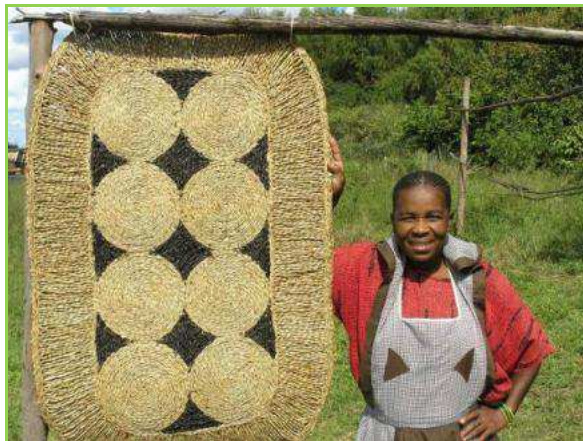
Plate B: Commercial products made by locals from reeds harvested from wetlands.