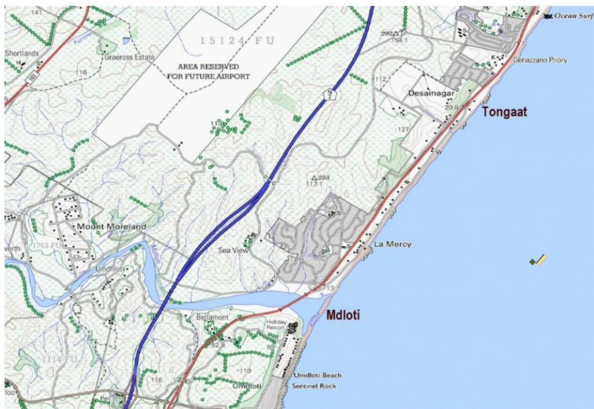
Figure 1-1: Locality Map of the proposed Tongaat desalination facility

appointed consulting engineers and completed in June 2015 (Aurecon, 2015), and this has been used to inform this EIA Process.