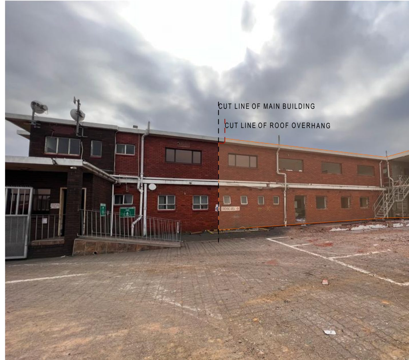
UTILITY WING TO BE DEMOLISHED