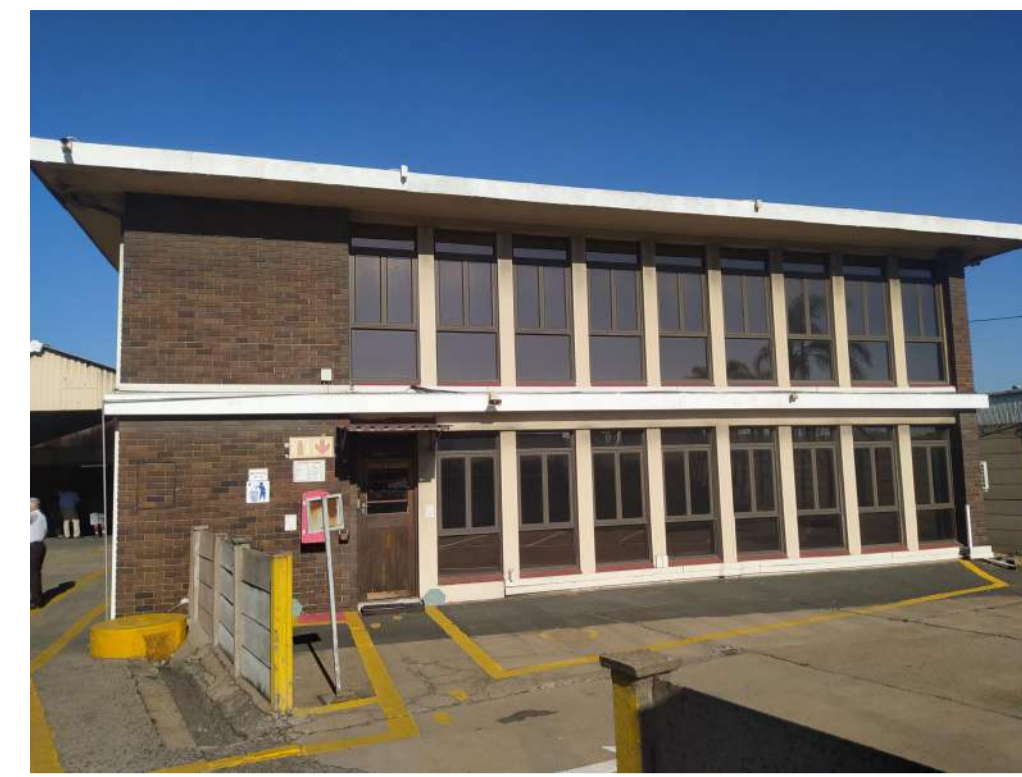
PORTION OF OFFICE RETAINED