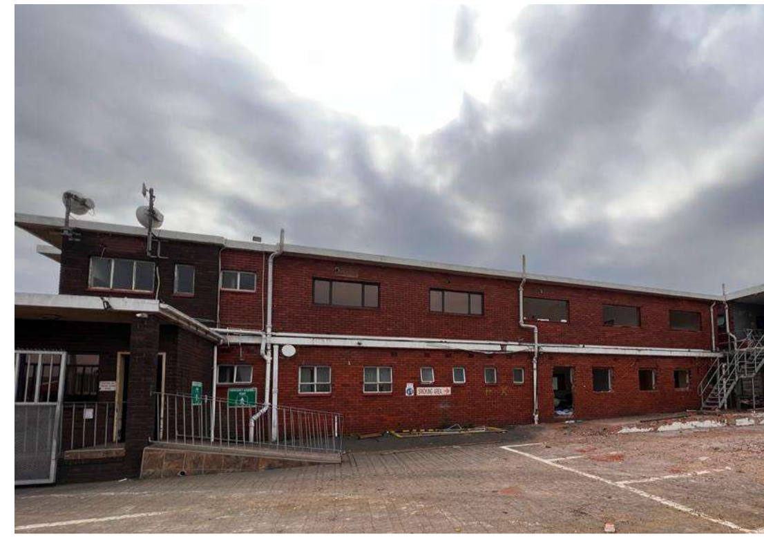
UTILITY WING TO BE DEMOLISHED