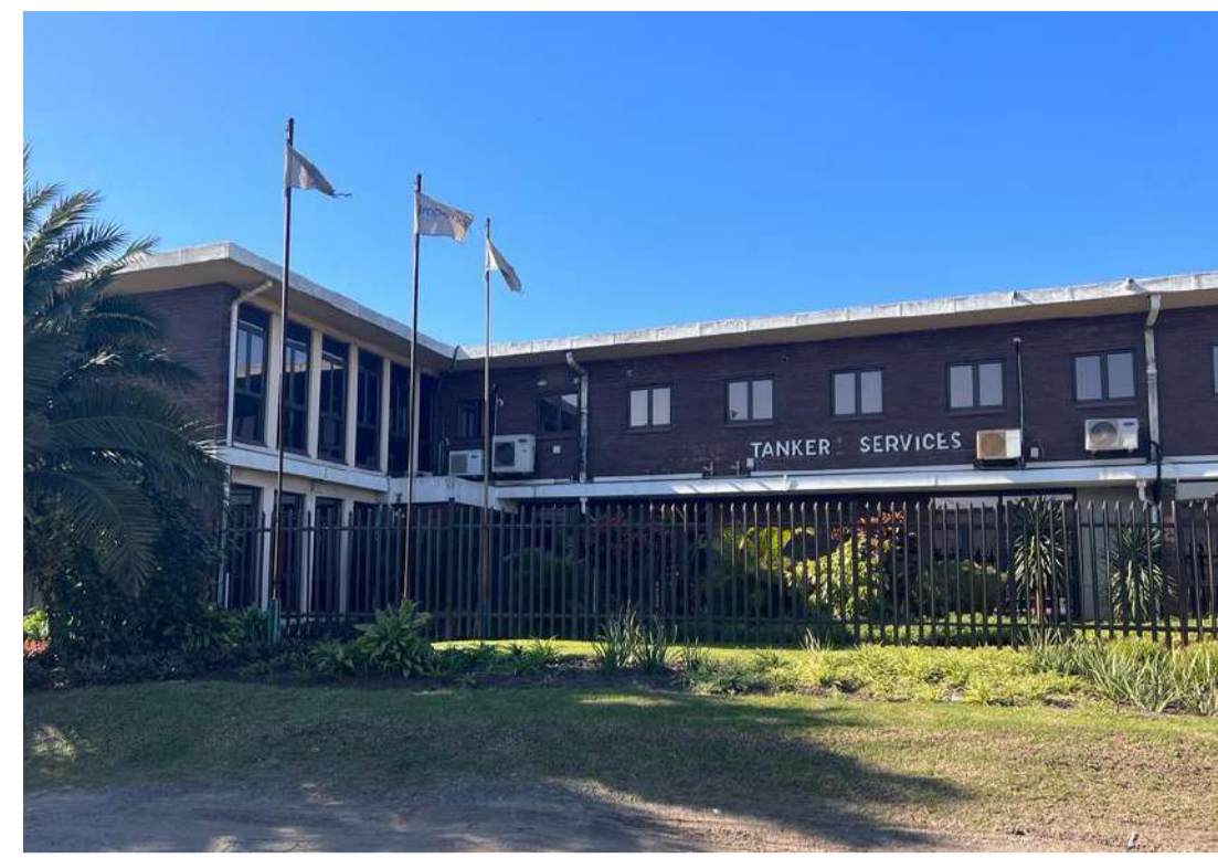
PORTION OF OFFICE RETAINED