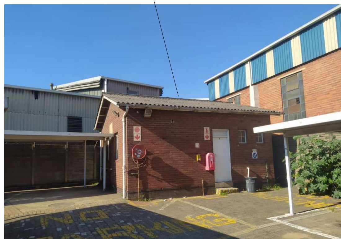
DEMOLISH TRAINING ROOM