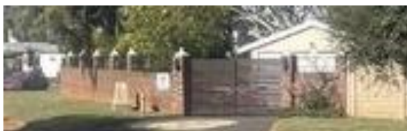
(Authors Picture) (NEIGHBOURS PICTURE) 6 FLACK PLACE