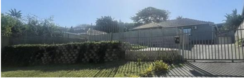
(Authors Picture) (NEIGHBOURS PICTURE) 20 FLACK PLACE