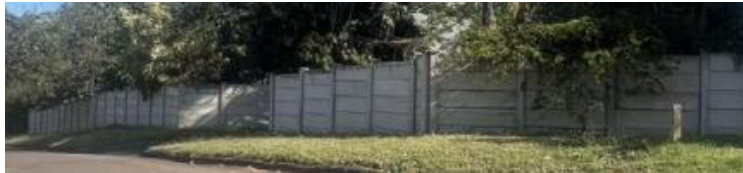
(Authors Picture) (NEIGHBOURS PICTURE) 3 FLACK PLACE