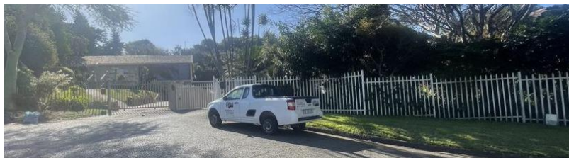
(Authors Picture) (NEIGHBOURS PICTURE) 17 & 19 FLACK PLACE