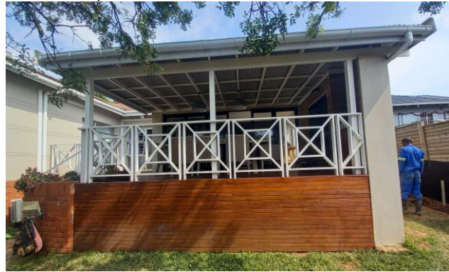
FRONT VIEW OF DWELLING