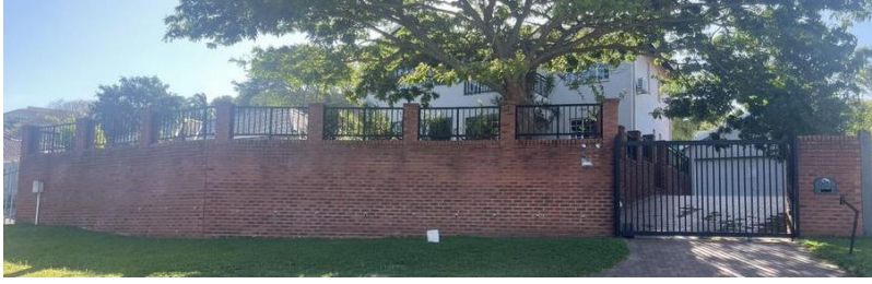
(Authors Picture) (NEIGHBOURS PICTURE) 18 FLACK PLACE