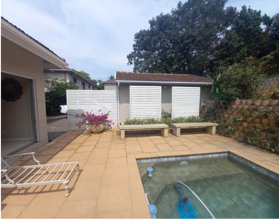
RIGHT VIEW OF GARAGE