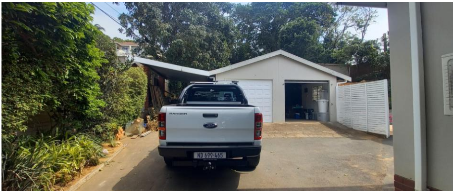
FRONT VIEW OF GARAGE