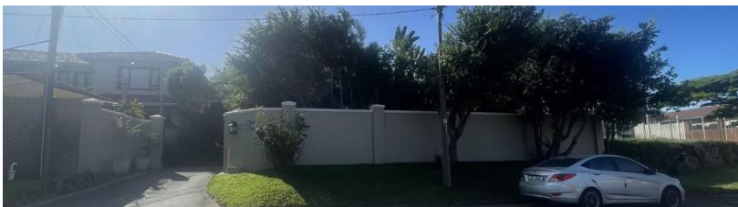
(Authors Picture) (NEIGHBOURS PICTURE) 22 FLACK PLACE