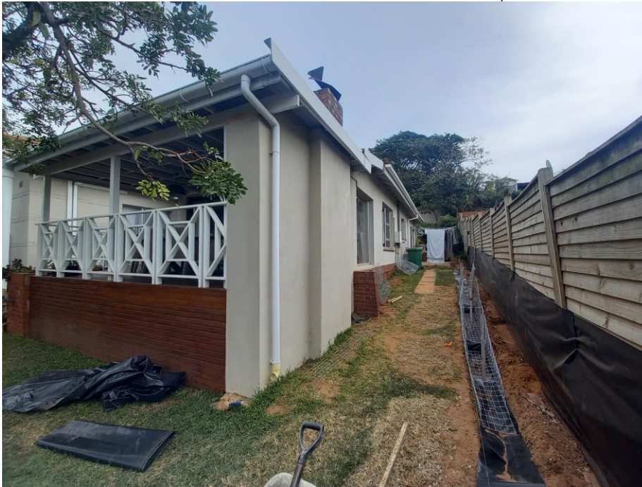
LEFT VIEW OF DWELLING