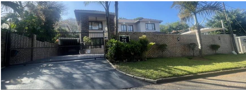
(Authors Picture) (NEIGHBOURS PICTURE) 21 FLACK PLACE