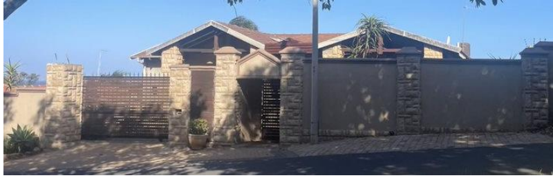
(Authors Picture) (NEIGHBOURS PICTURE) 104 MARGARET MAYTOM AVENUE