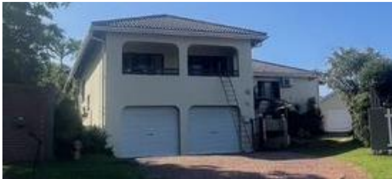
(Authors Picture) (NEIGHBOURS PICTURE) 16 FLACK PLACE