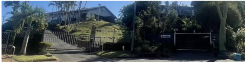
(Authors Picture) (NEIGHBOURS PICTURE) 11 & 15 FLACK PLACE