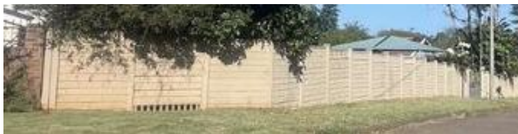
(Authors Picture) (NEIGHBOURS PICTURE) 4 FLACK PLACE