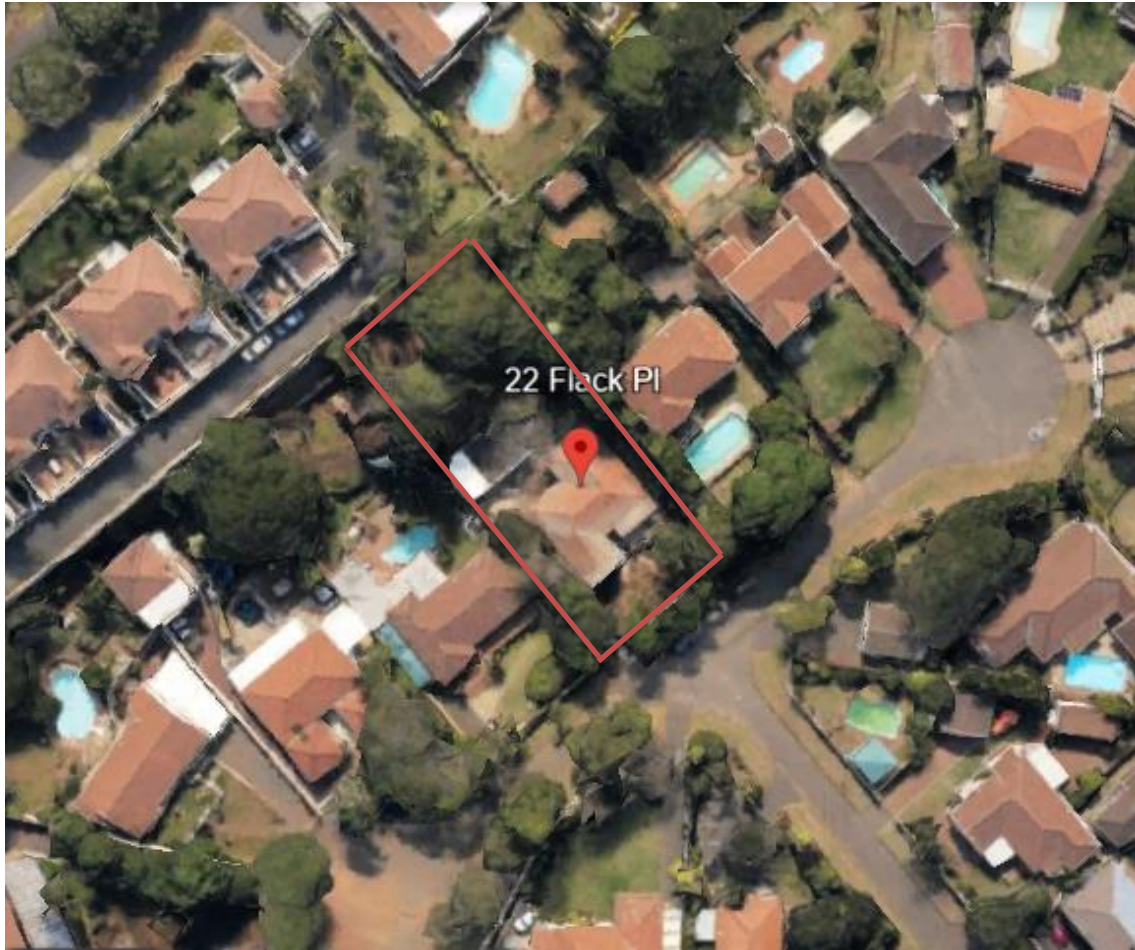
(GOOGLE EARTH) ARIEL SITE: 1: 50 000