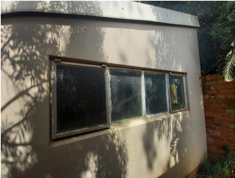
RIGHT VIEW OF O/B