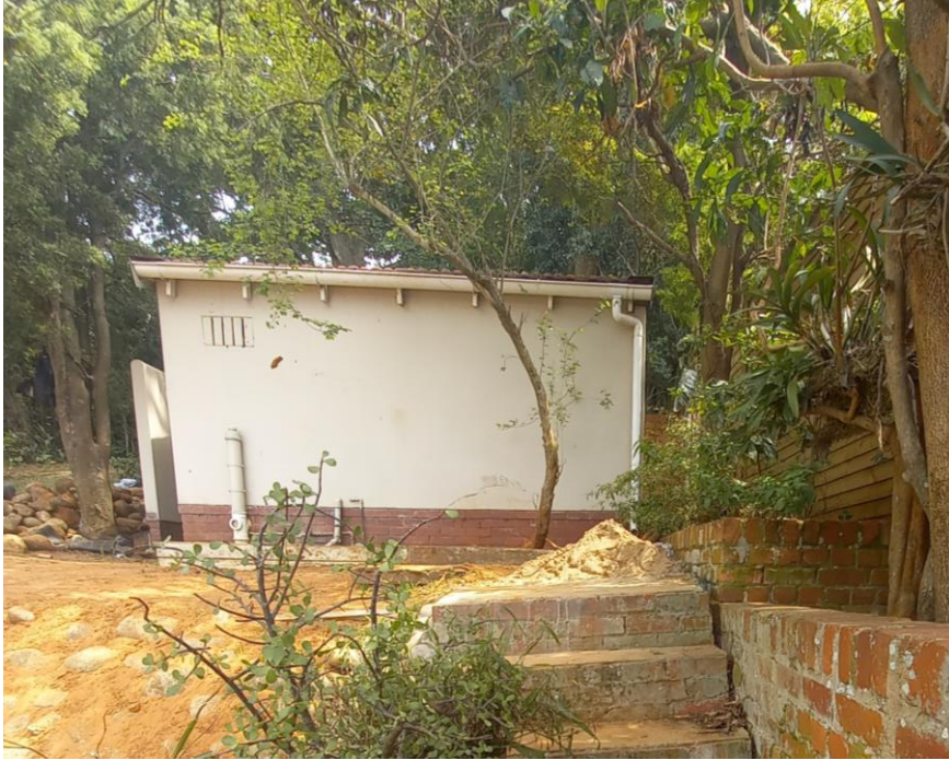
FRONT VIEW OF O/B