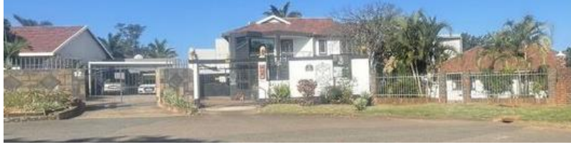
(Authors Picture) (NEIGHBOURS PICTURE) 8, 10 & 12 FLACK PLACE