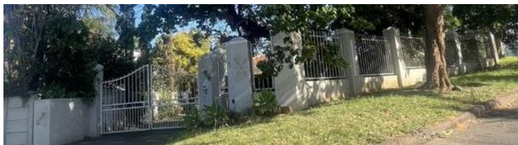
(Authors Picture) (NEIGHBOURS PICTURE) 5 FLACK PLACE