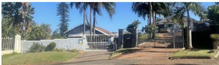
(Authors Picture) (NEIGHBOURS PICTURE) 7 & 9 FLACK PLACE