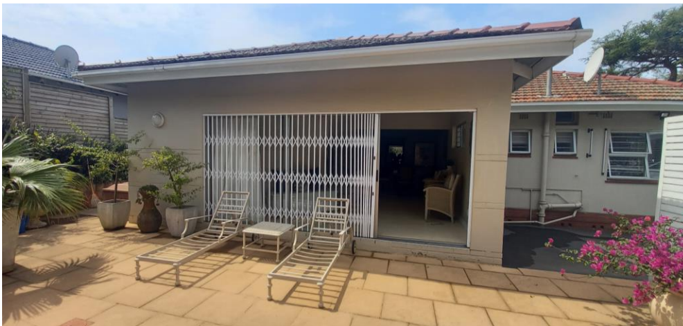
(Authors Picture) REAR VIEW OF DWELLING