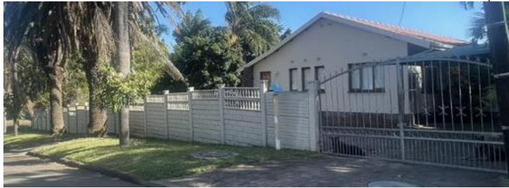
(Authors Picture) (NEIGHBOURS PICTURE) 1 FLACK PLACE