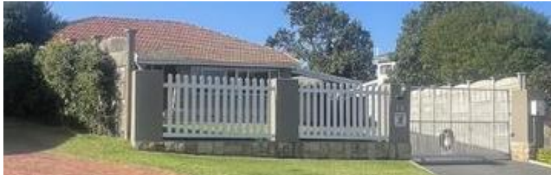
(Authors Picture) (NEIGHBOURS PICTURE) 14 FLACK PLACE