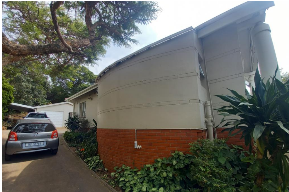
LEFT VIEW OF DWELLING