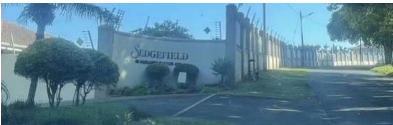
(Authors Picture) (NEIGHBOURS PICTURE) 98 MARGARET MAYTOM AVENUE