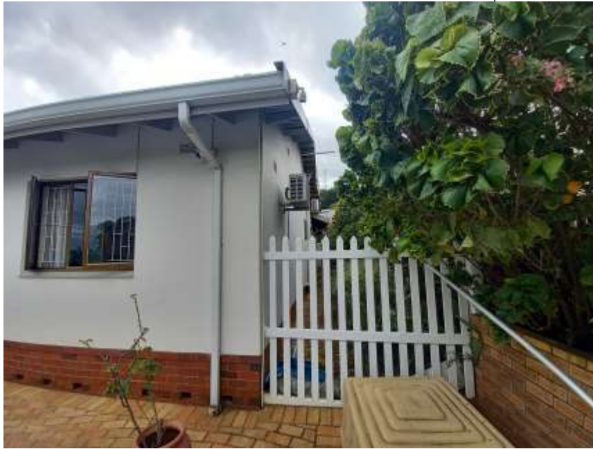
(Authors Picture) RIGHT VIEW OF DWELLING