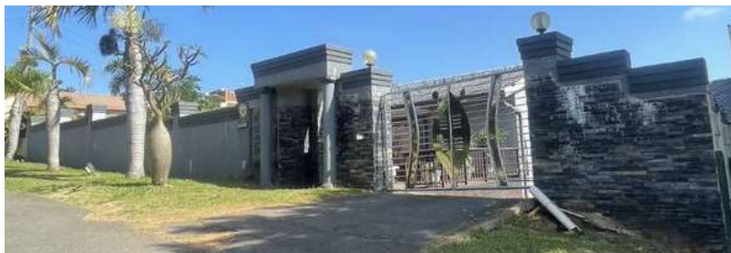
(Authors Picture) (NEIGHBOURS PICTURE) 11 ORTHMAN ROAD