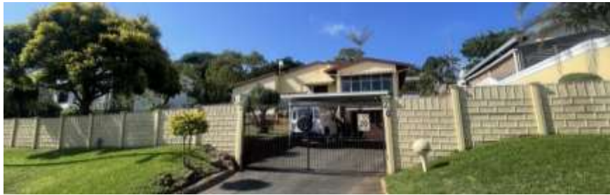
(Authors Picture) (NEIGHBOURS PICTURE) 20 ORTHMAN ROAD