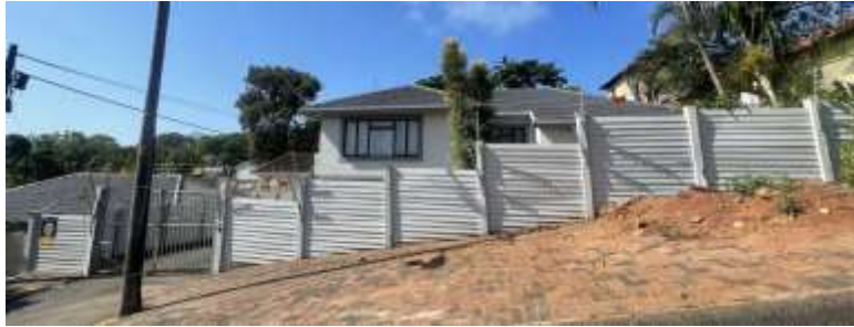
(Authors Picture) (NEIGHBOURS PICTURE) 4 ORTHMAN ROAD