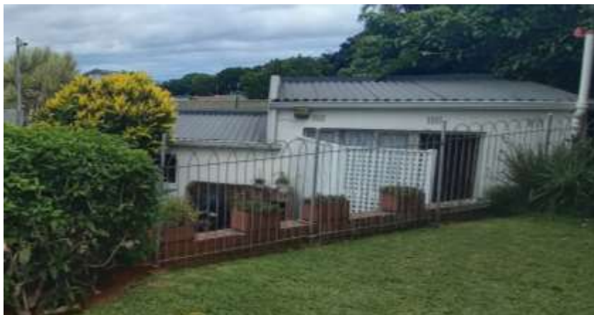
RIGHT VIEW OF GARAGE