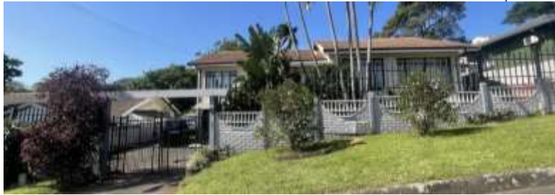
(Authors Picture) (NEIGHBOURS PICTURE) 8 ORTHMAN ROAD