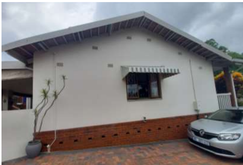
LEFT VIEW OF DWELLING