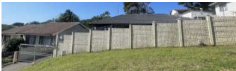
(Authors Picture) (NEIGHBOURS PICTURE) 6 ORTHMAN ROAD