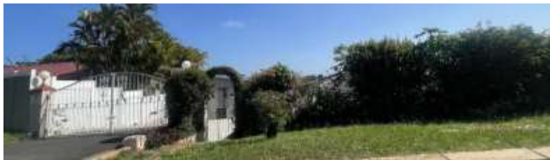
(Authors Picture) (NEIGHBOURS PICTURE) 5 ORTHMAN ROAD