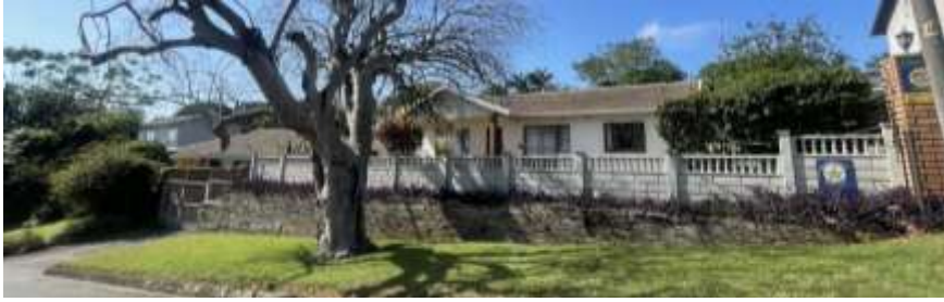
(Authors Picture) (NEIGHBOURS PICTURE) 14 ORTHMAN ROAD