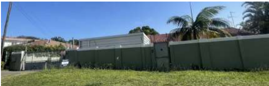
(Authors Picture) (NEIGHBOURS PICTURE) 17 ORTHMAN ROAD