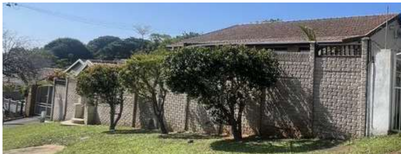
(Authors Picture) (NEIGHBOURS PICTURE) 12 ORTHMAN ROAD