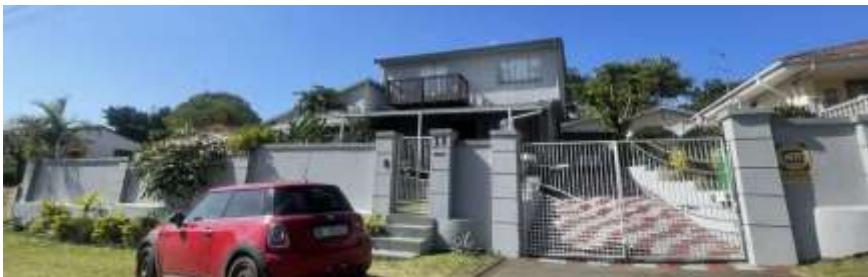
(Authors Picture) (NEIGHBOURS PICTURE) 18 ORTHMAN ROAD