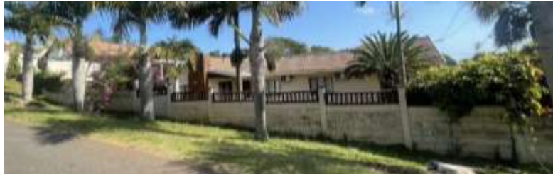
(Authors Picture) (NEIGHBOURS PICTURE) 9 ORTHMAN ROAD