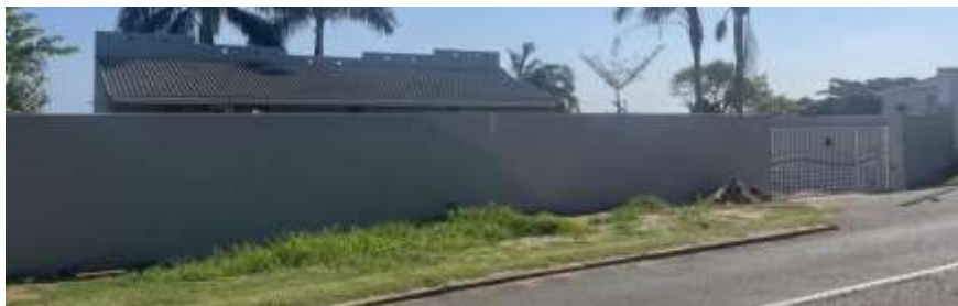
(Authors Picture) (NEIGHBOURS PICTURE) 25 LONGWOODS DRIVE