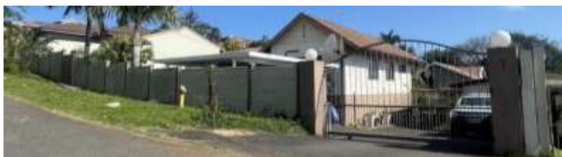
(Authors Picture) (NEIGHBOURS PICTURE) 7 ORTHMAN ROAD