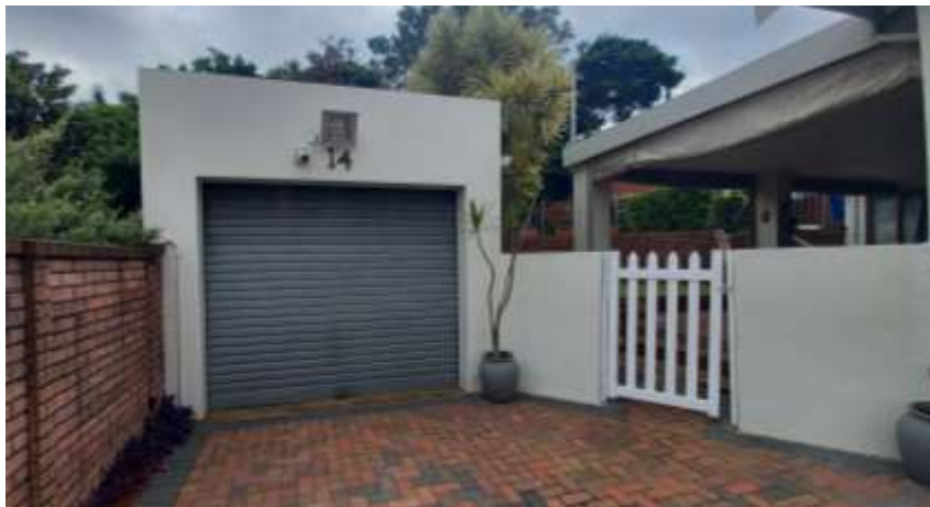
FRONT VIEW OF GARAGE