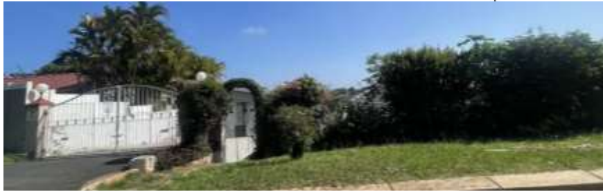
(Authors Picture) (NEIGHBOURS PICTURE) 19 ORTHMAN ROAD