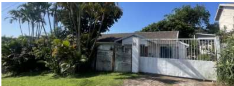
(Authors Picture) (NEIGHBOURS PICTURE) 10 ORTHMAN ROAD