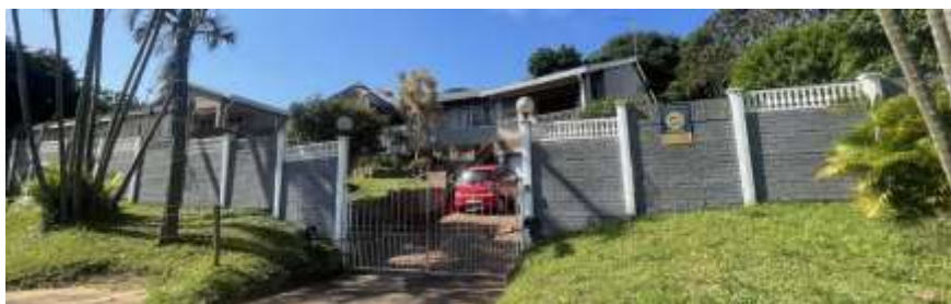
(Authors Picture) (NEIGHBOURS PICTURE) 24 ORTHMAN ROAD