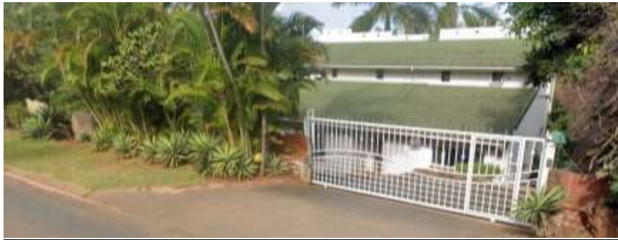
(Authors Picture) (NEIGHBOURS PICTURE) 21 LONGWOODS DRIVE