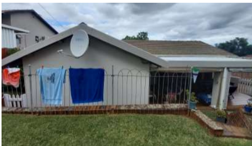
REAR VIEW OF DWELLING