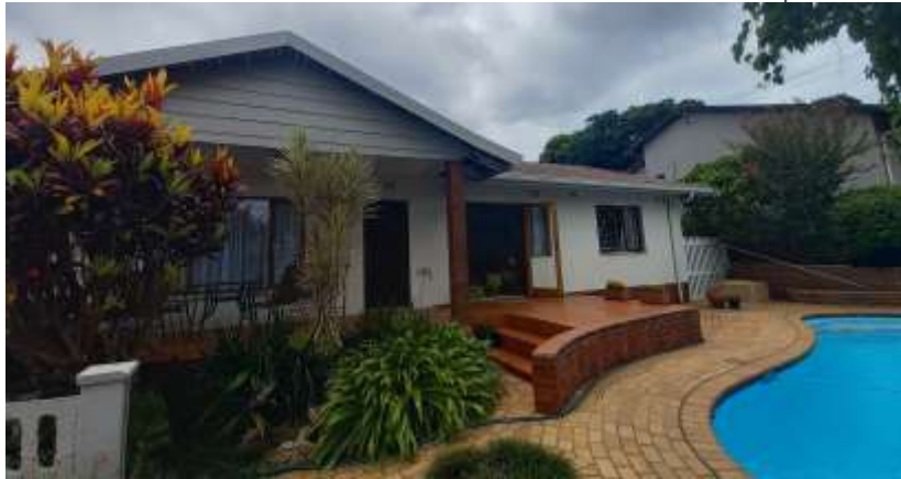
FRONT VIEW OF DWELLING