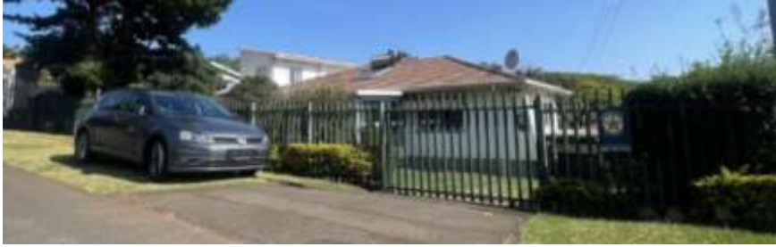
(Authors Picture) (NEIGHBOURS PICTURE) 15 ORTHMAN ROAD