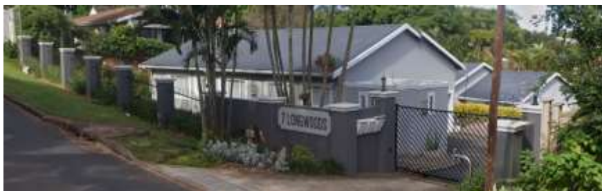
(Authors Picture) (NEIGHBOURS PICTURE) 7 LONGWOODS DRIVE