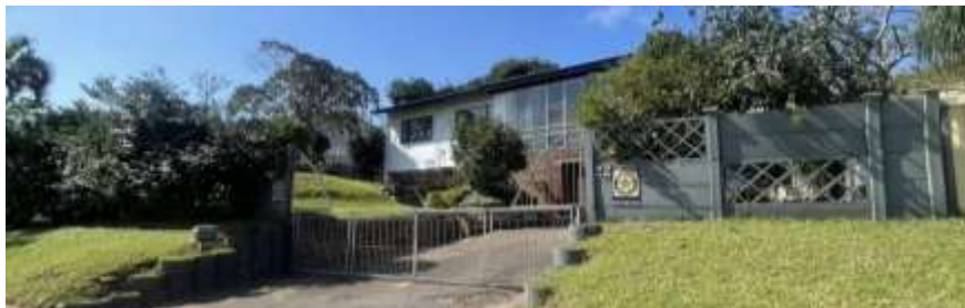
(Authors Picture) (NEIGHBOURS PICTURE) 22 ORTHMAN ROAD