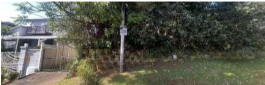
(Authors Picture) (NEIGHBOURS PICTURE) 16 ORTHMAN ROAD