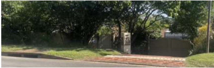
(Authors Picture) (NEIGHBOURS PICTURE) 15 LONGWOODS DRIVE