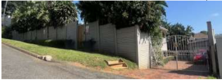
(Authors Picture) (NEIGHBOURS PICTURE) 3 ORTHMAN ROAD