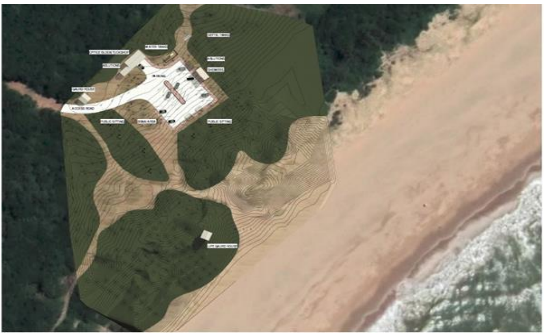
Figure 2 : Dokodweni Beach Development concept plan