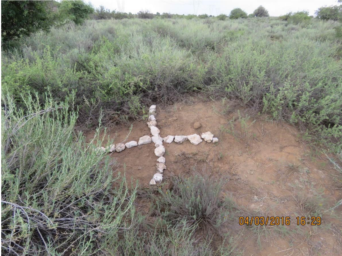
Figure 4. Drill site.

The site was found to consist of a drainage area immediately east of a cluster of dolerite hills. Dongas provide opportunities to assess some of the subsurface archaeology of the area.