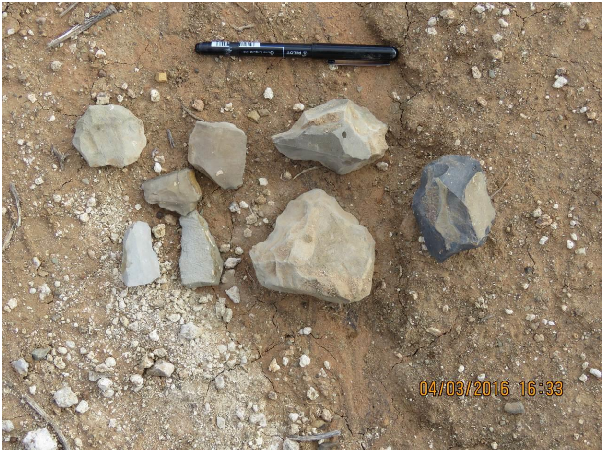
Figure 5. Artefacts found at the site.

No organic remains were found. The significance of these specific eroded occurrences is but sealed contexts in the wider vicinity may be of importance.