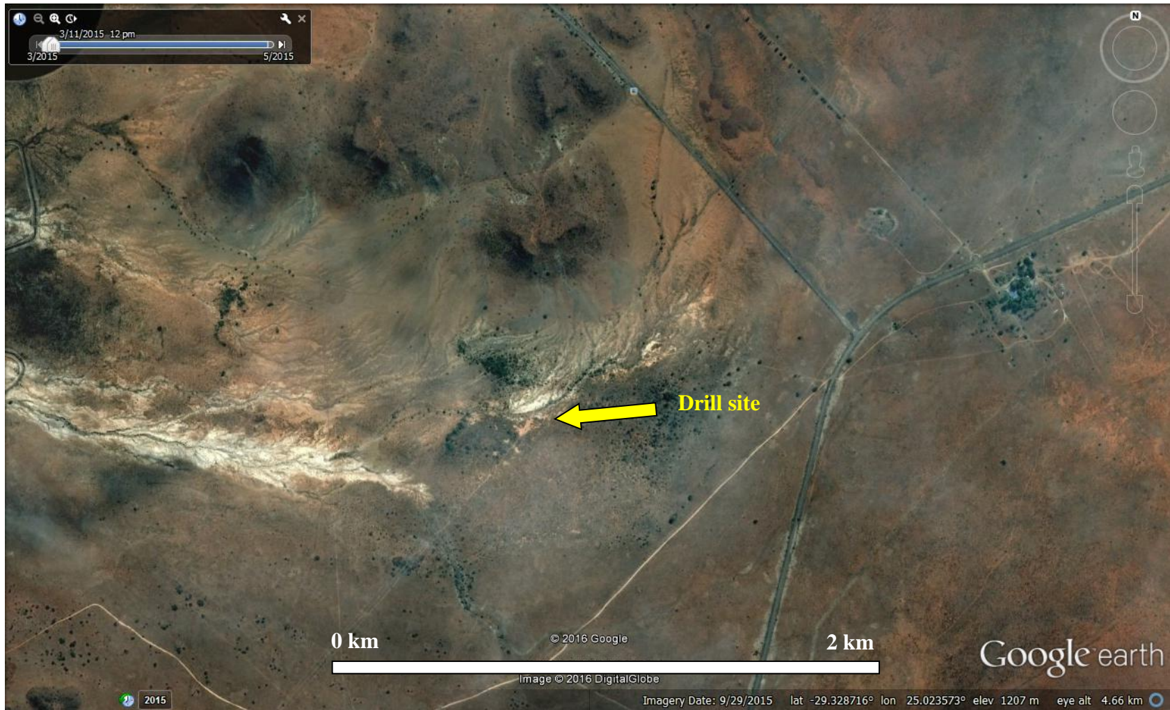
Figure 3. Google Earth image showing position proposed drilling site.