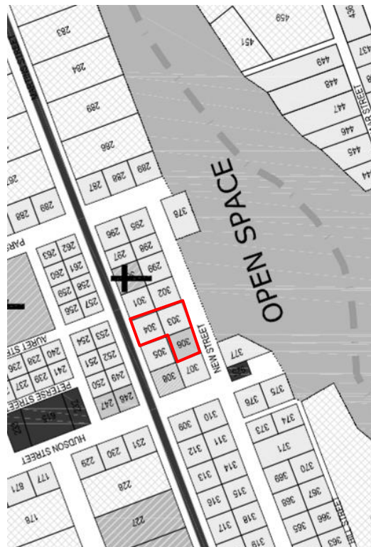
Figure 2: Proposed National Heritage Site