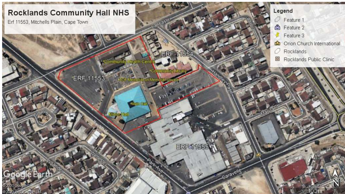
Figure 1: Rocklands Community Hall NHS Boundaries