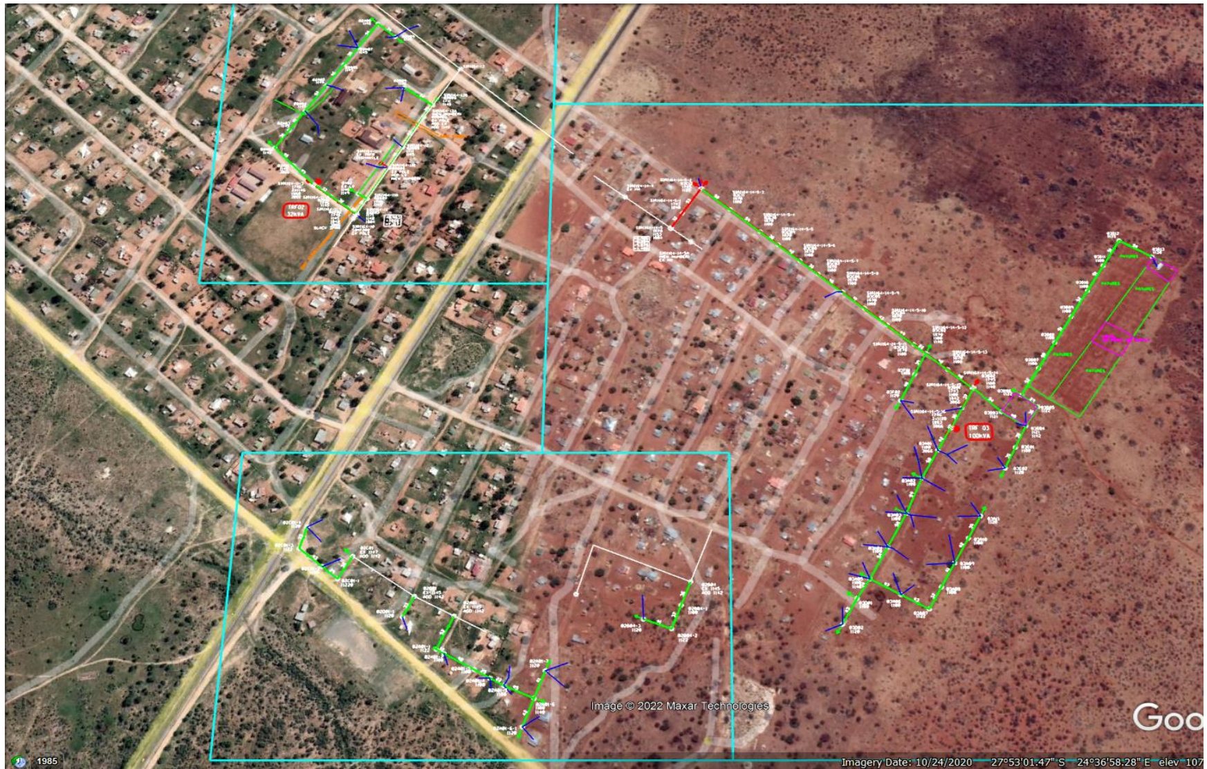
Image 1. Proposed power line in green and red. Existing power line in white and orange.