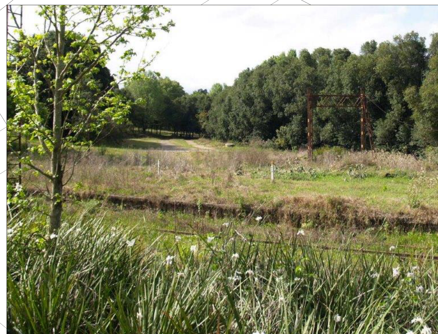
7 View of the Site from Hilton Avenue