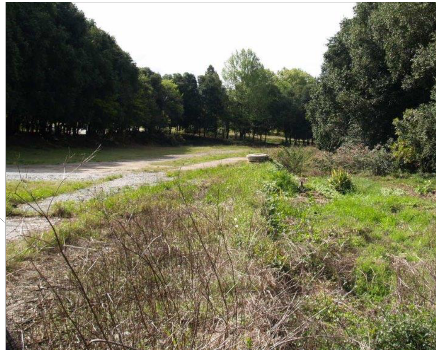
6 View from the existing Gantry, along the railway siding, towards North