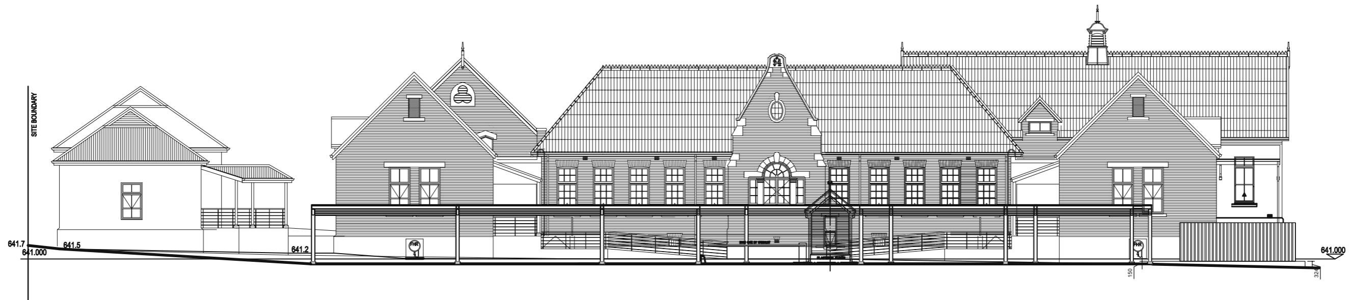
SOUTH EAST ELEVATION 1:200