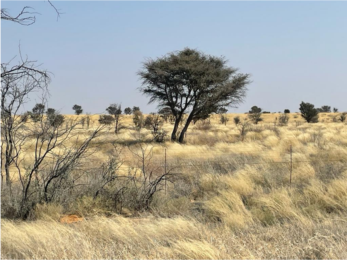
Figure 9.1: A picture depicting the existing activities.