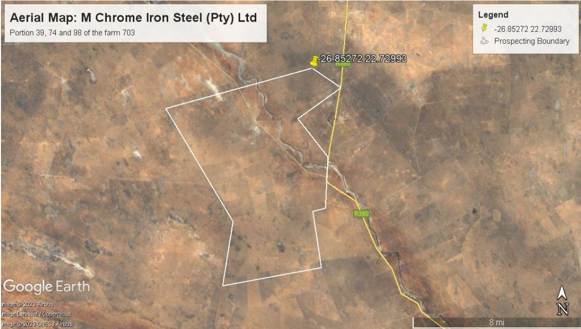
Figure: 9.2: Aerial map