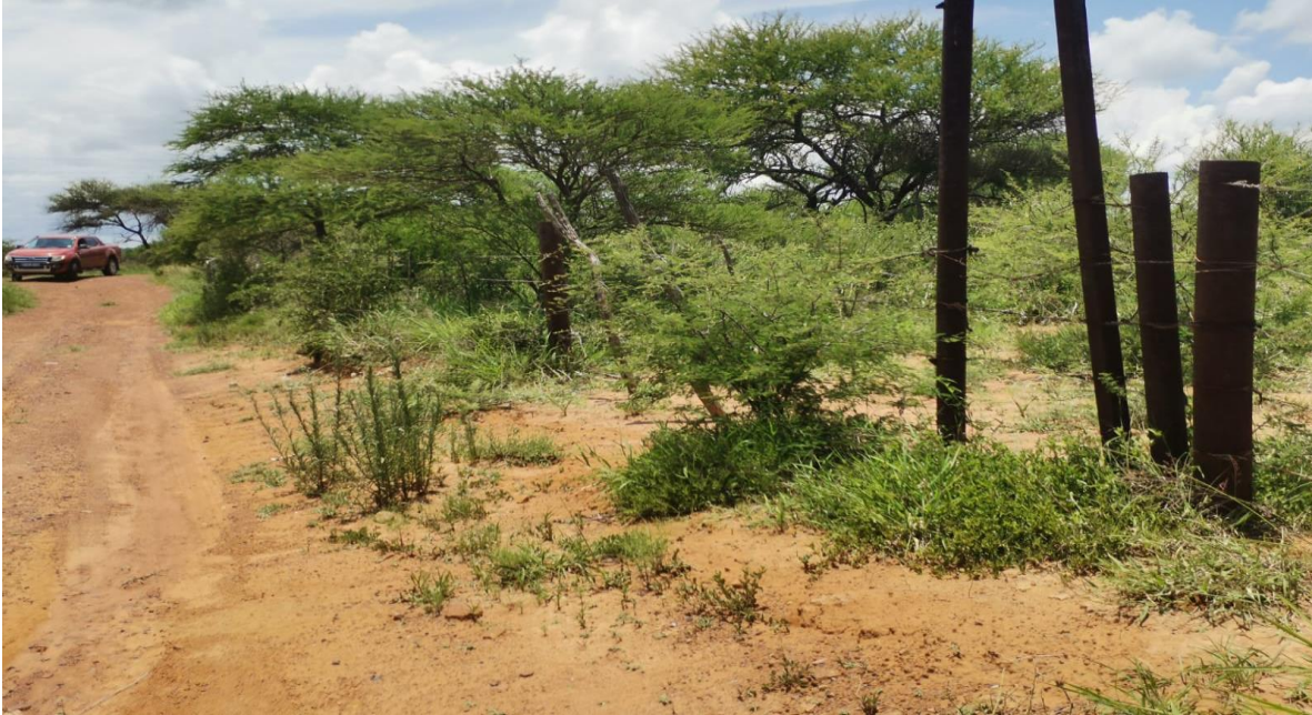
Figure 9.1: A picture depicting the existing activities