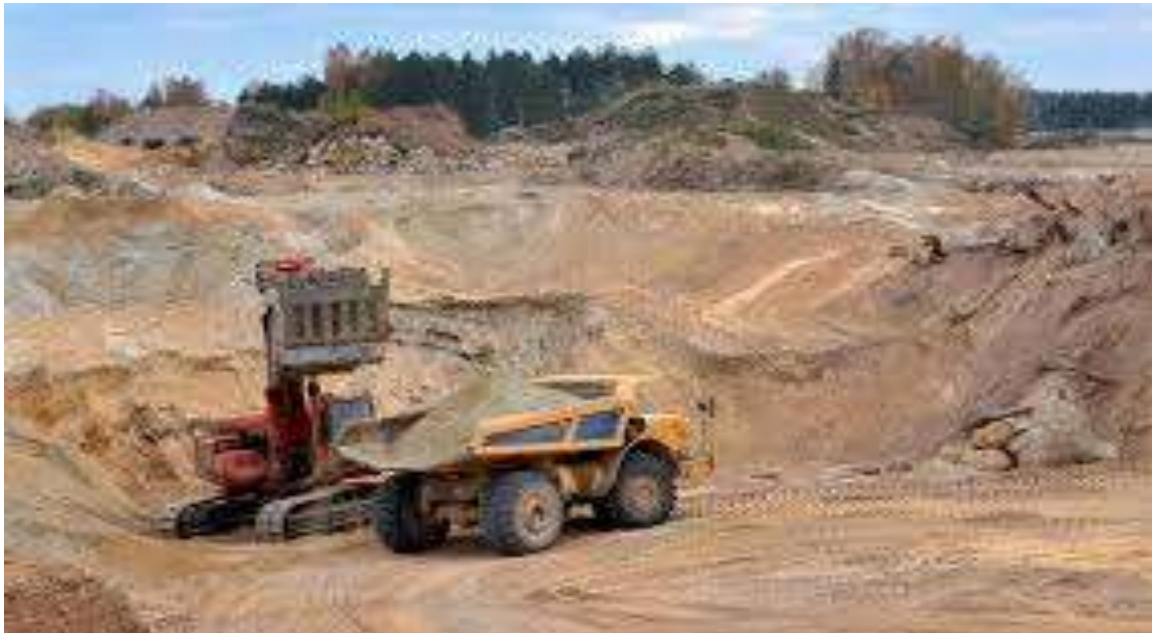
Figure 4.2: An illustration of sand mining method

The project infrastructure and activities will include site clearance, removal of topsoil and overburden and stockpiling, site establishment, including maintenance of an access route, mobilisation of equipment and preparation of area for mining, excavation of an open pit, loading zone, loading and dust control, crushing and screening of ore, hauling and transporting of ore, ablation facilities and waste storage area and rehabilitation of site.