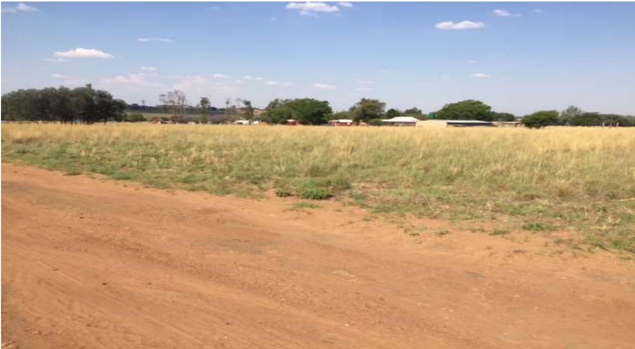
Figure 8-2: Existing adjacent residential sites that to be affected by the proposed mining activity on the farm

mining activities. The applicant intends to avoid sensitive environmental features when the workers come across during the mining operations. Mining operations will be conducted on portion of portion 39 of the farm. Refer to figure 8-2 for the residential properties adjacent the site that are existing within the mining operations.