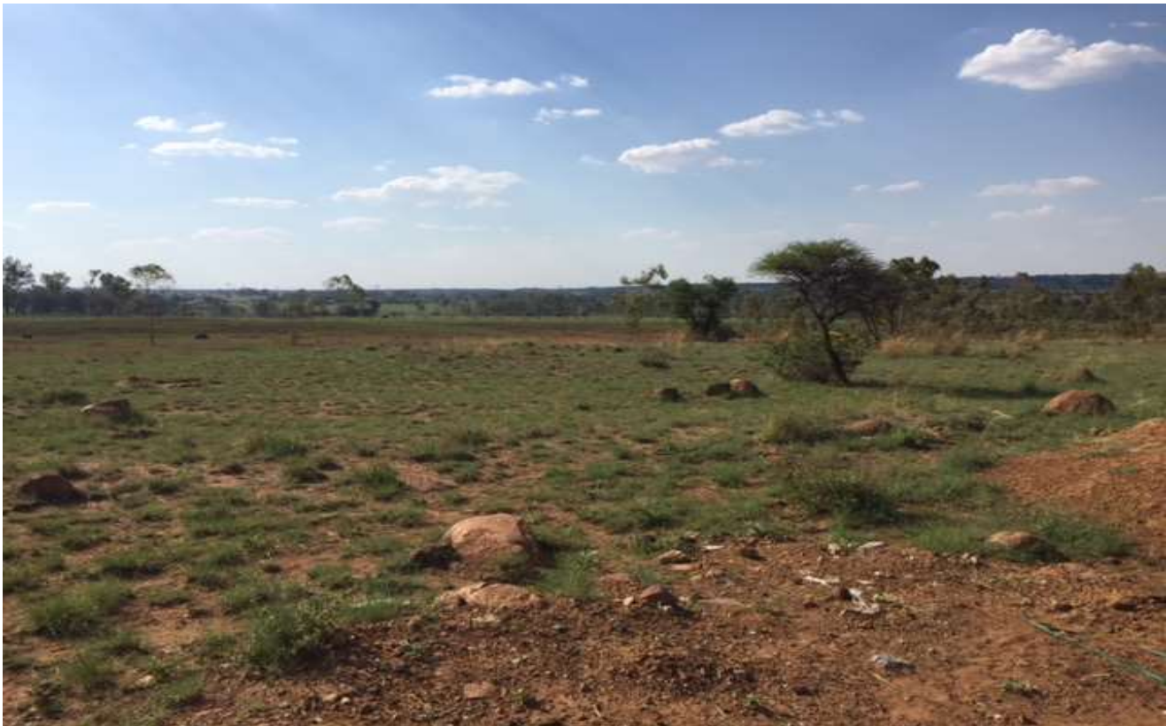
Figure 8-1: The view of the site terrain and vegetation

The study area is situated on a Highveld escarpment. It falls between the Daspoortstrand and on the north and Skurweberge to the south. It is on an average of the 1320m above sea level with a general slope of the downwards towards the north. Refer to figure 8-1 and 8-2 below for terrain morphology.