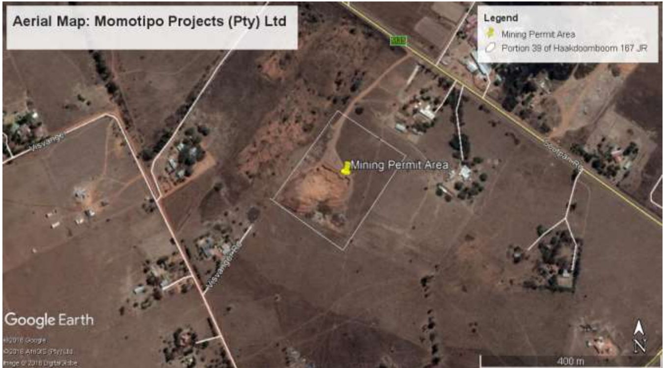
Figure 8.3: Aerial Map