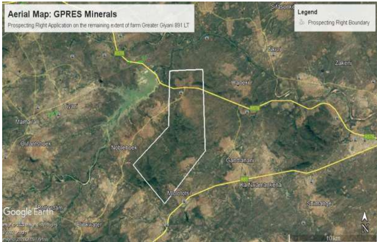
Figure: 9.1: Aerial map