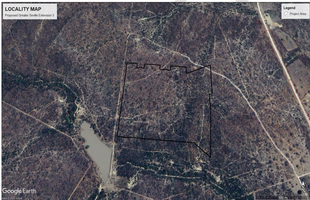
Figure 1: Aerial locality map of the proposed development site

The proposed township will be situated on the Remainder of Portions 1 and 2 of the Farm Seville 224 KU in Seville, Mpumalanga Province. The project area is located approximately 18km from Thulamahashe town. The site is located roughly at the following GPS coordinates: 24°39' 33.48" S; 31°24'16.94"E. Figure 1 and 2 below indicate the locality of the proposed development site. The SG digit code is: