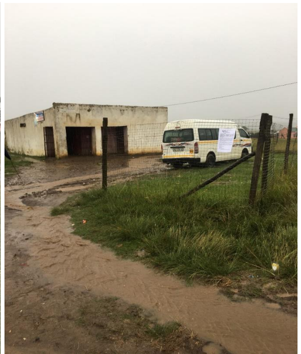
Figure 3: View of some of the notices in public centres.