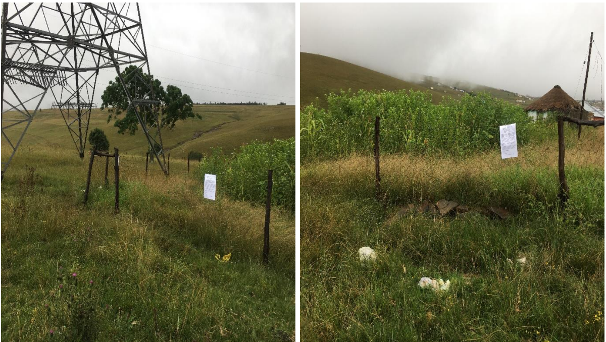
Figure 2: View of site notices pasted in the area.