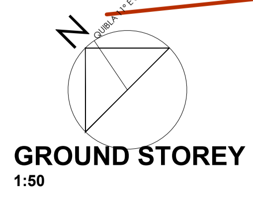
GROUND STOREY 1:50

Project Description PROPOSED ADDITIONS AND ALTERATIONS TO EXISTING DWELLING