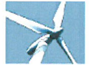
Renewable & Low Carbon