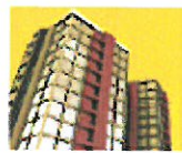
Planning & Development