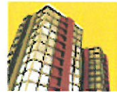
Planning & Development