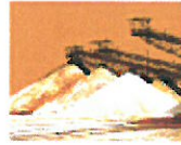
Mining & Minerals