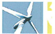
Renewable & Low Carbon