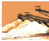
Mining & Minerals