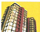
Planning & Development