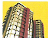
Planning & Development