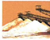
Mining & Minerals