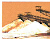
Mining & Minerals