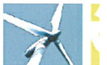
Renewable & Low Carbon