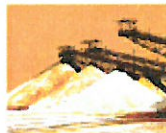
Mining & Minerals