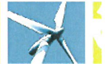
Renewable & Low Carbon