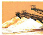
Mining & Minerals