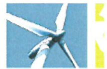
Renewable & Low Carbon