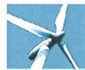
Renewable & Low Carbon