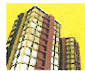
Planning & Development