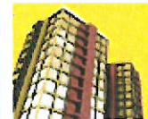
Planning & Development