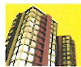
Planning & Development