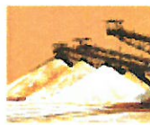
Mining & Minerals