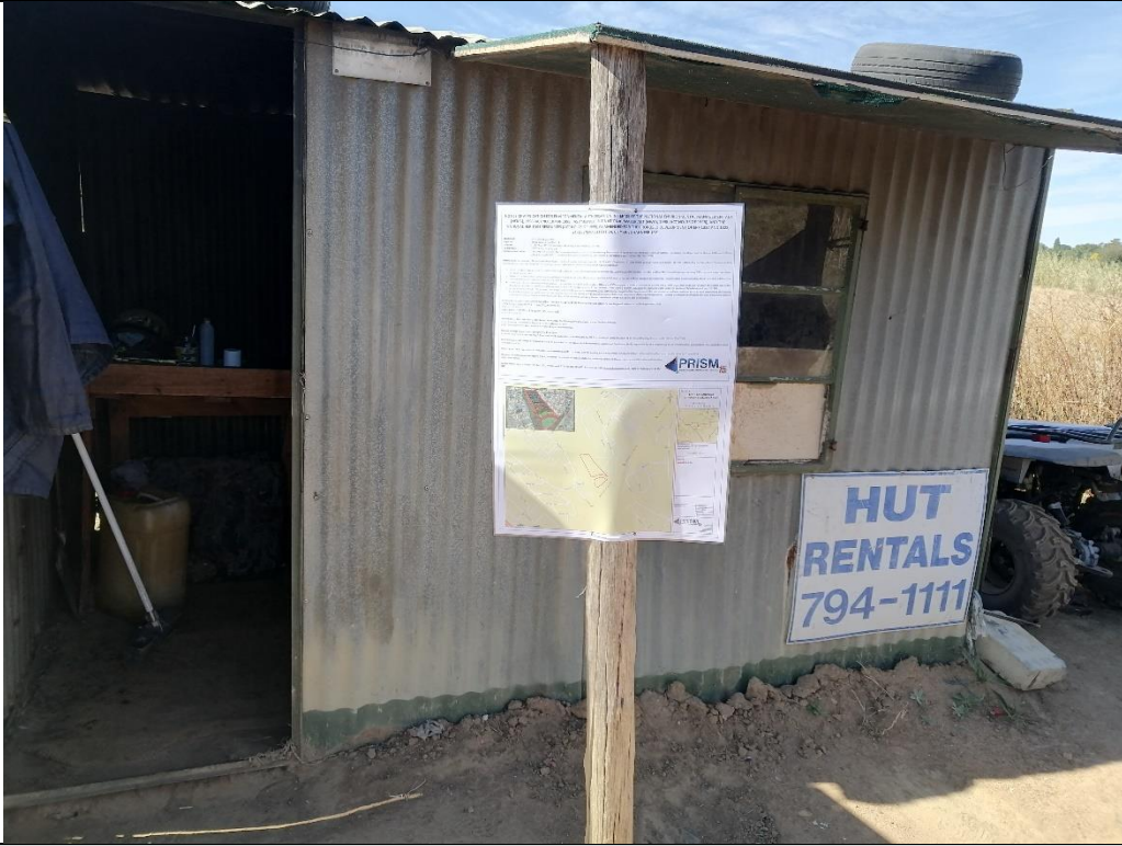
Site Notice 3