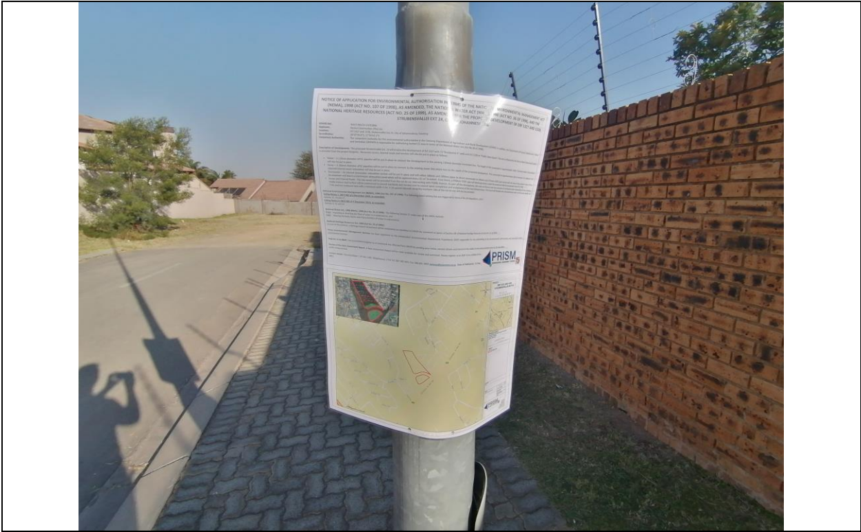
Site Notice 1