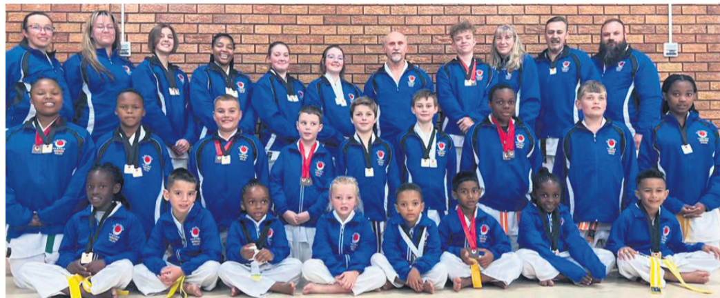
The karateka with their medals won at the provincial JKA Championships.