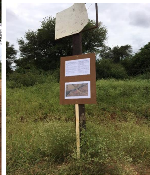
Figure x to x: Images of erected site notices