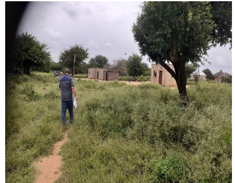
Figure x to x: Imagery of public engagement by consultants, and distribution of BIDs to residences and businesses in vicinity of causeway.