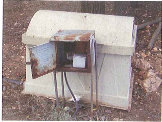
Groundwater abstraction from a borehole