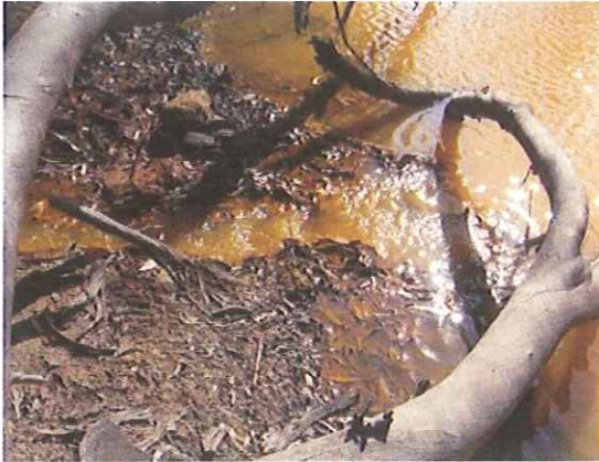
Acid mine drainage impacting on the environment