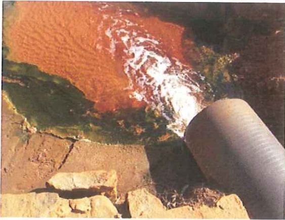
Discharge into a water resource