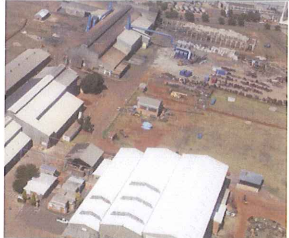
Aerial view of an industrial site