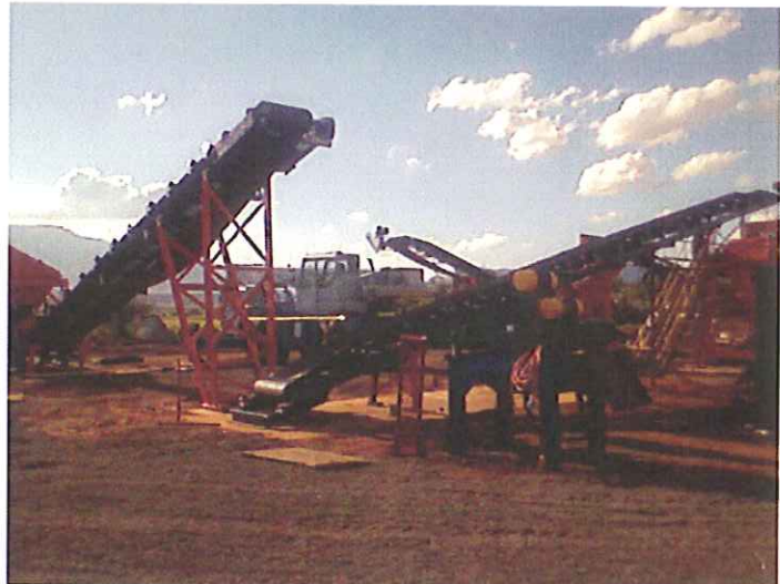
Waste licence required: Waste processing - screening & separation