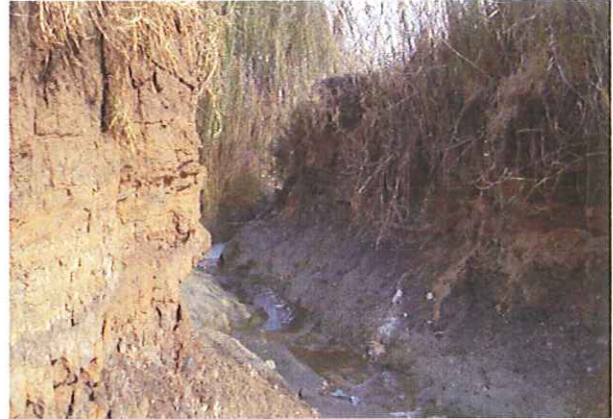
Erosion caused by poor storm water management