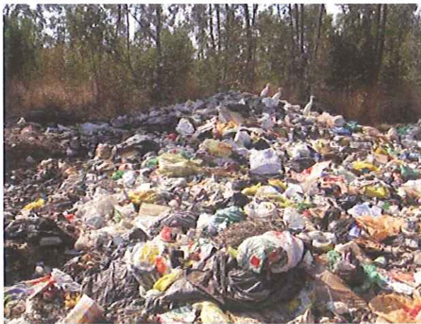
General waste dumping