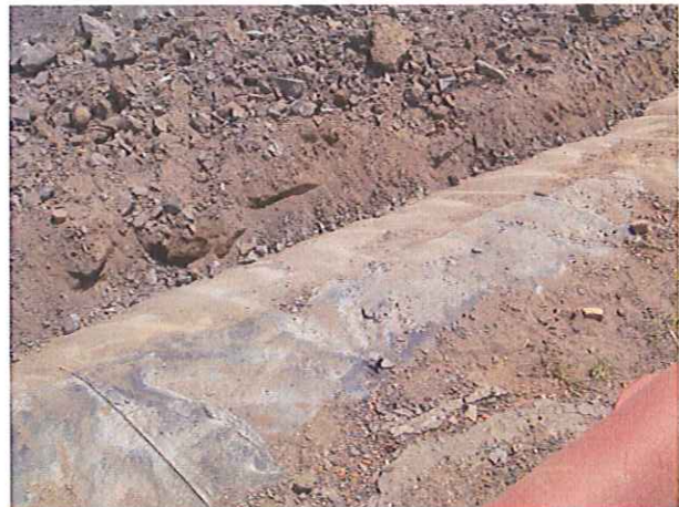
Hazardous waste disposal facility with HDPE liner