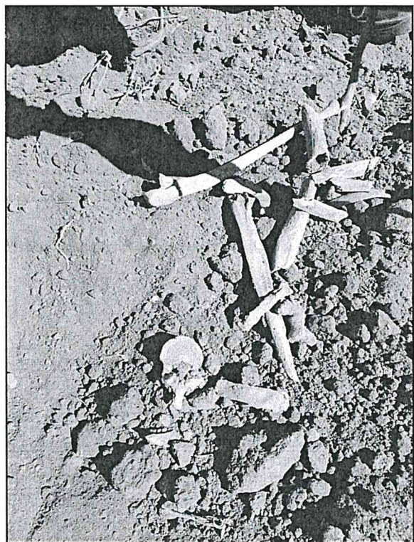
View of the bones that were unearthed.