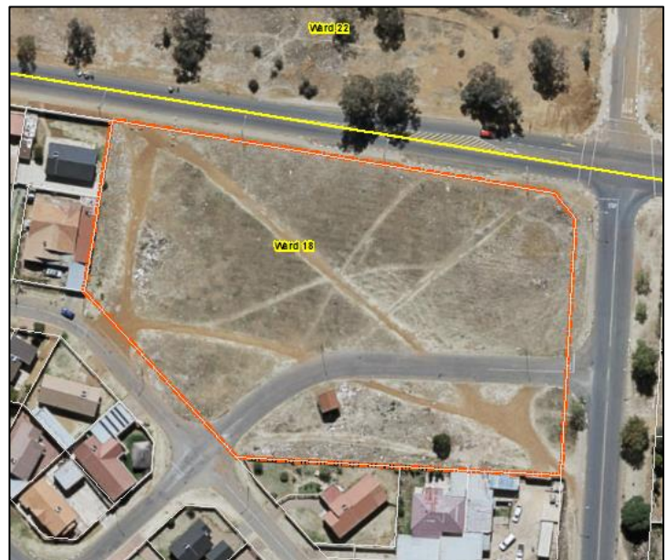
Figure 1: Proposed Project Area

The project area is currently vacant, however, there is illegal dumping taking place on small portions of the site. No CBAs, ESAs, protected areas, wetlands or watercourses have been identified within the project area.