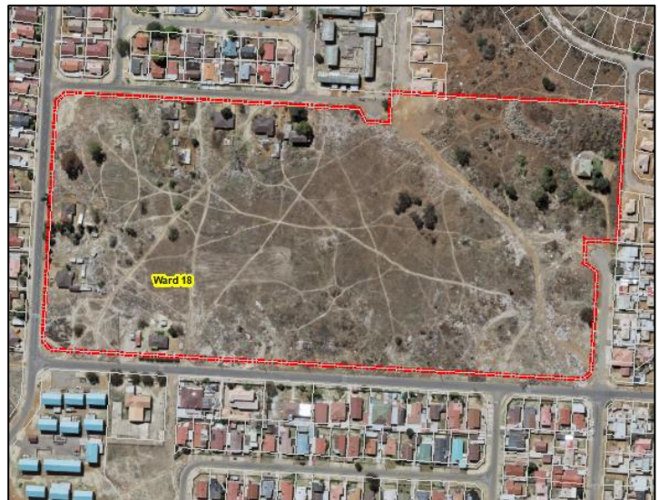
Figure 1: Proposed Project Area

Majority of the project area is currently vacant, however, there are several formal and informal household structures that are on site along with illegal dumping. No ESAs, protected areas or watercourses have been identified however a large easterly portion of the site is classified as CBA 1 and majority of the site is considered as HPAL.