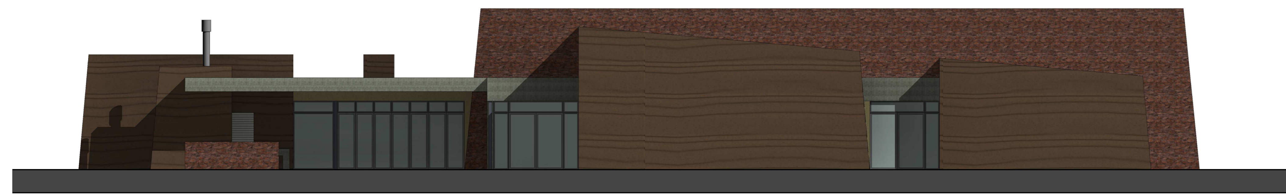
④ West Elevation 1 : 100