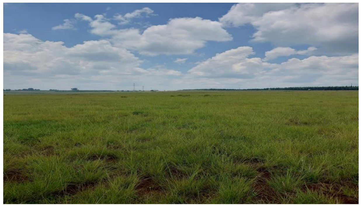
Figure 4: Vegetation cover of the area