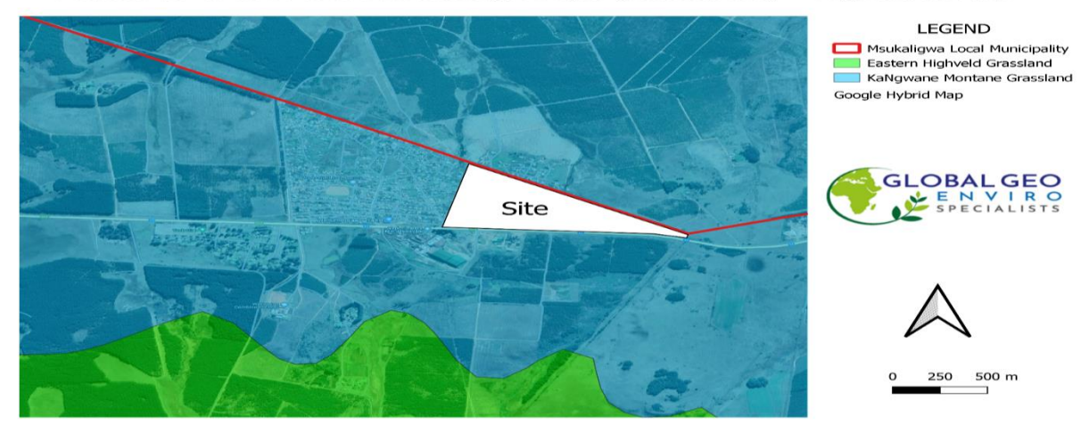
Portion 15 of the Farm Ferniehaugh 70,IT (Warburton) - Vegetation Map

Mucina and Rutherford (2006) classified the study area to be in the Highveld Grassland vegetation type. The vegetation type is found in Mpumalanga, Existing vegetation in the undeveloped areas of Msukaligwa Local Municipality consists predominantly of typical Highveld grasslands. Within the proposed site herbaceous plants and invasive weeds are the ones appearing at stature of young seedlings and only few trees to the range of 1-1,5m height. Invasive plant species are the ones that dominate the area as confirmed during surveys throughout the study area. Wattle trees plantation exist in the surrounding vicinity of the area.