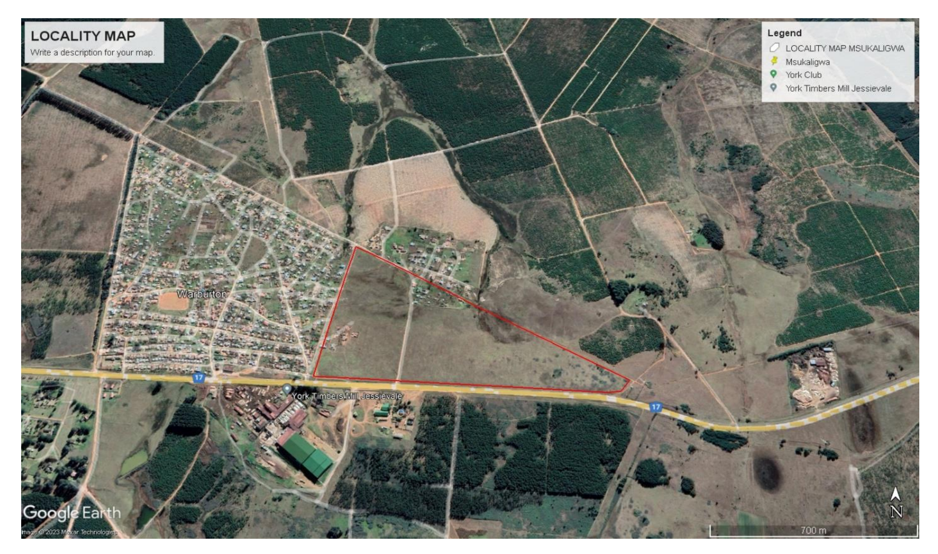
Figure 3: Locality Map of proposed site