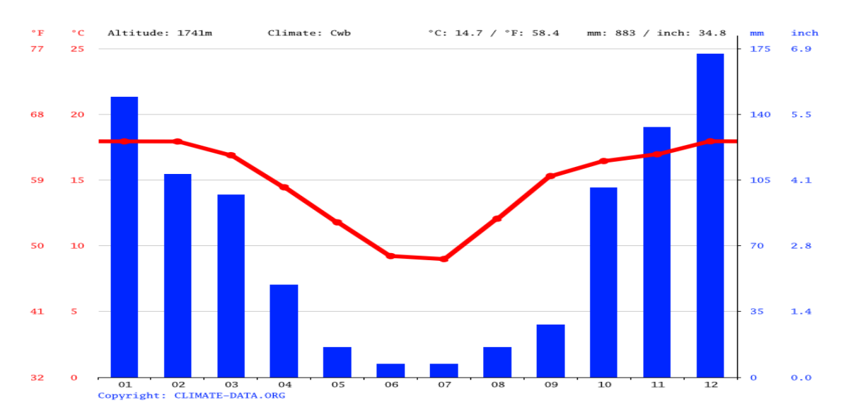
Figure 2: climatic factor of the area