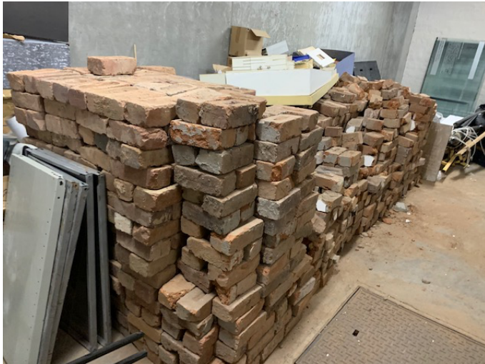
Figure 17 Bricks that were removed from internal walls, stored on site.