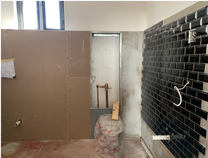
Figure 7 Tiling onto drywall in the ablutions, during construction.

The ablutions have been upgraded as per drawings to allow for a paraplegic bathroom. Tiling was done onto a drywall skin, making it easily reversible in the future.