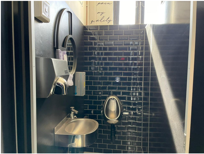
Figure 24 Ablutions, Urinal cubicle