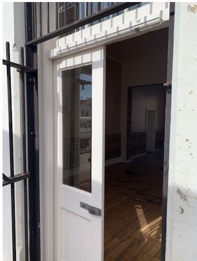
Figure 13 Exterior view of newly painted timber door