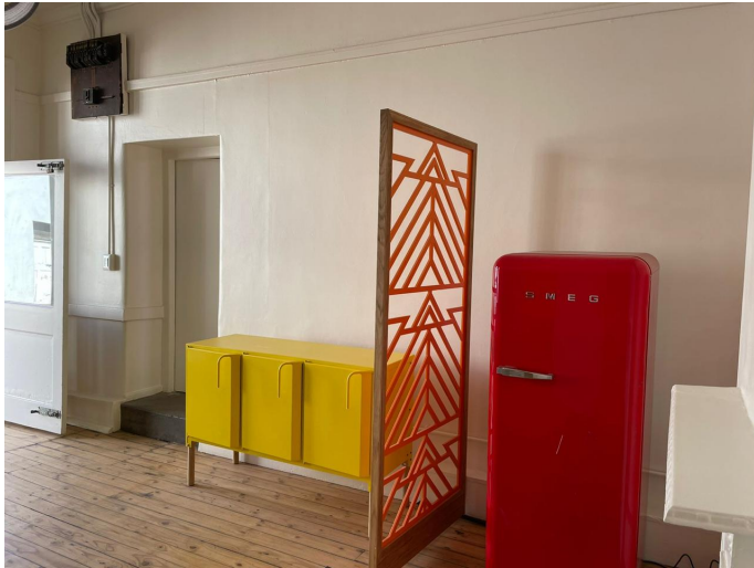
Figure 22 Foyer, looking North-west, new fireplace fitted at original fire surround