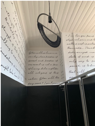
Figure 26 Ablutions, interior view of wall and stall panels