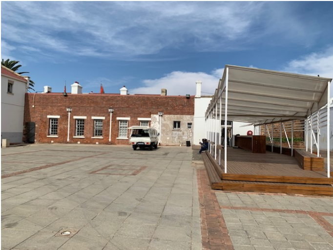
Figure 12 Exterior view of south facade and courtyard