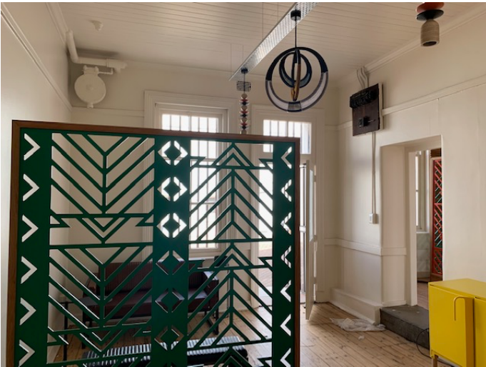
Figure 5 Foyer, showing ceiling.

The main item of renovation was to make a new opening to the bathroom. This opening is not marked in anyway. There was no issue with patching the floor here as the bathroom floor is a concrete grano finish. The pressed metal fireplace backdrop has been retained. A new contemporary closed fireplace has been installed in front of this existing pressed metal backdrop. The ability to warm the space using the fireplace reaffirms the contrast between Warder and prison spaces. In order to use the existing flue and to comply with the flue height a new discreet opening has been made into the pressed metal.