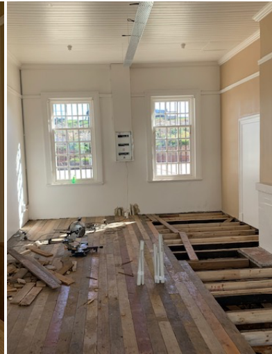
Figure 10 Meeting room, installation of new timber floor, during construction.