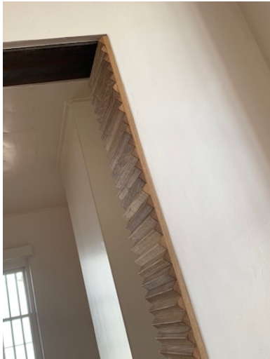
Figure 4 Detail.