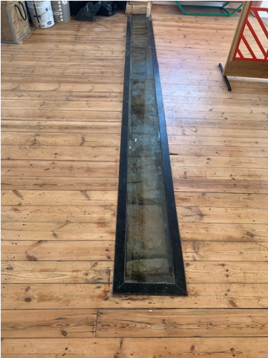
Figure 2 Event room floor with Glass inset