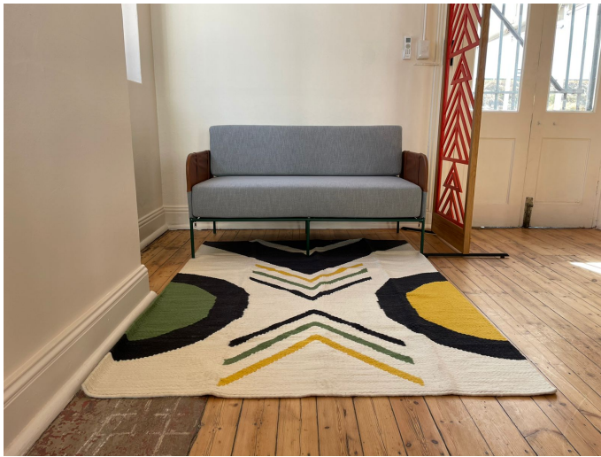
Figure 19 Event room looking North