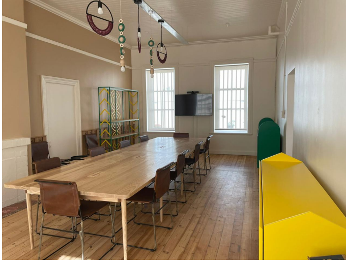
Figure 27 Meeting room, looking South-east