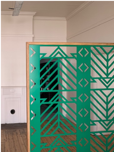
Figure 6 Foyer, showing new opening and fireplace.