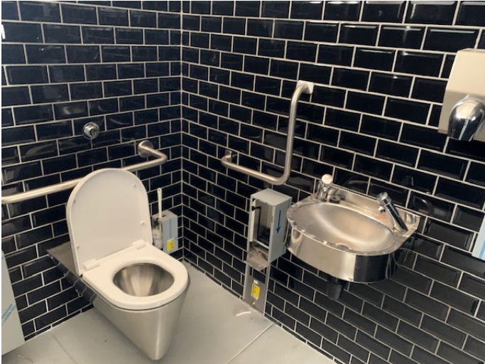
Figure 25 Ablutions, interior view of paraplegic stall