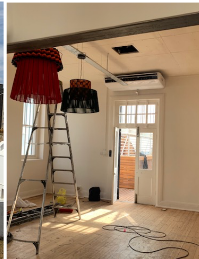
Figure 15 Interior view showing AC installation in events room