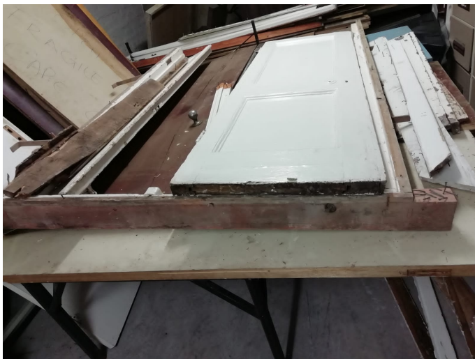
Figure 16 Door that was removed from Event room, stored on site.