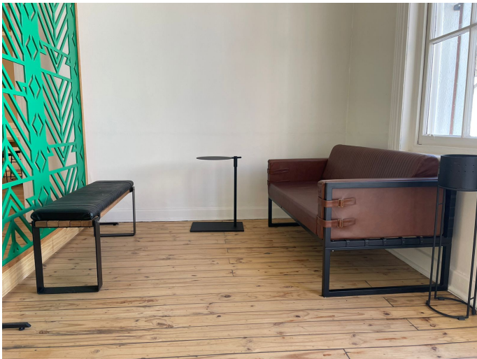
Figure 23 Foyer, looking South-east