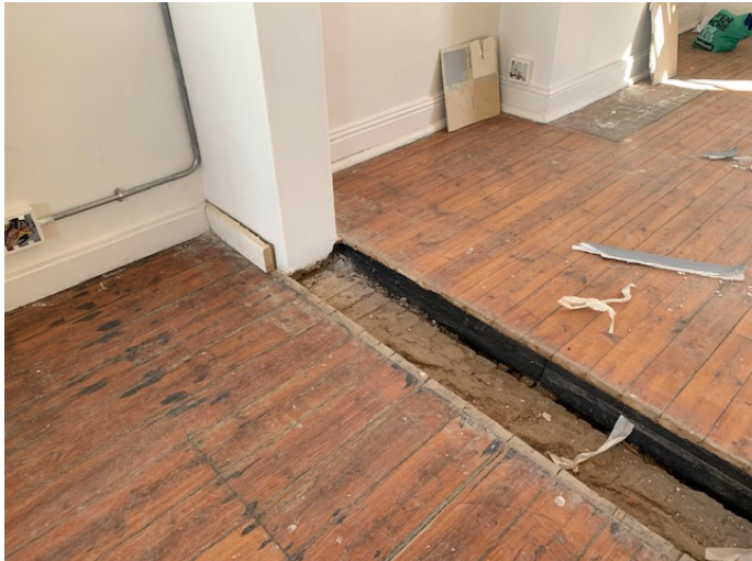
Figure 1 Event room floor showing new opening, during construction.

Through the making of an opening within an interior wall two rooms have been joined to form one larger functional space. The new wall opening has been demarcated with exposing the steel bottom face of the structural lintol, the horizontal lines are marked by decorative timber panels and the floor is demarcated with a glass panel in the area where the removed wall was. Please note that the floor had to be slightly raised here in order to achieve a level floor surface. The timber double doors and frame have been removed and stored safely.