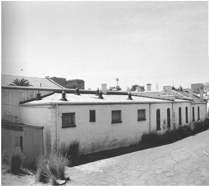
Figure 11 This image of the old Fort hospital by Chris Reilly is to be on the heritage panel adjacent to the text.

The brick demarcations show the foundation walls of the demolished buildings.