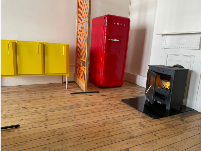
Figure 21 Foyer, looking North-west, new fireplace fitted at original fire surround. Fire place specification: Nero by Hydrofire.co.za, 39.8 x 51.5 x 65cm 150mm flue diameter