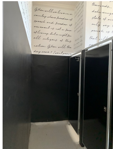
Figure 8 New freestanding panel and door system.