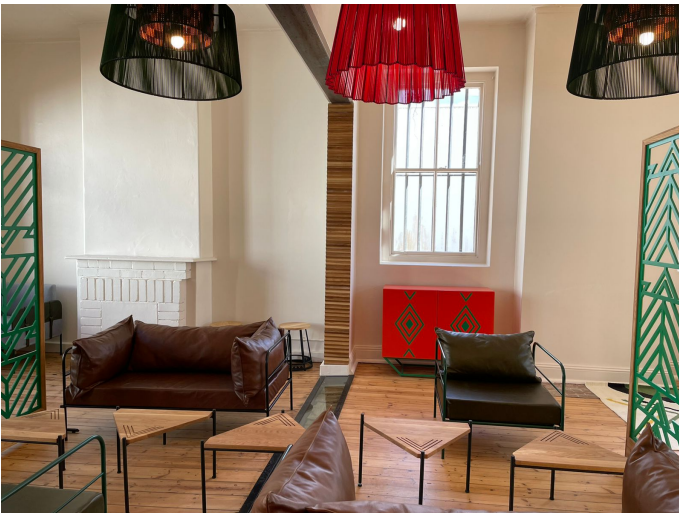
Figure 20 Event room looking West