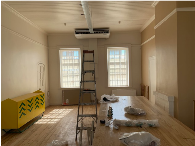
Figure 9 Meeting room, showing new AC and floor points