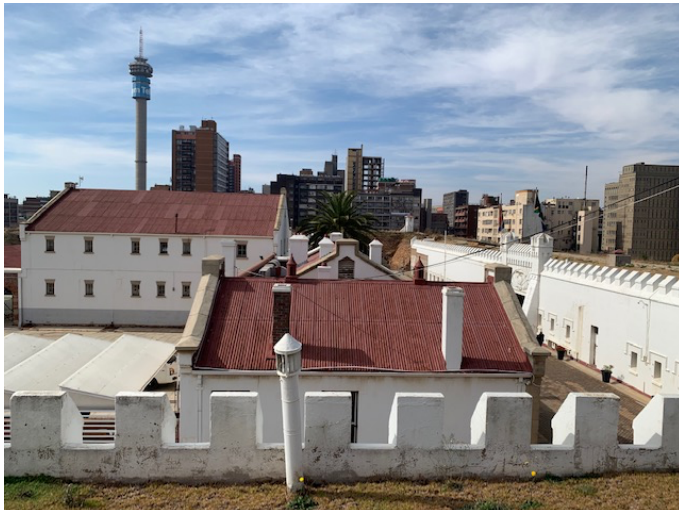
Figure 14 Exterior view of roof – showing hidden AC installation

The Refrigerant piping goes through an existing defunct kitchen extraction duct that sits on the roof. The condenser units are placed on the inner face of the North Parapet, which is over a meter tall and conceals the condensers.