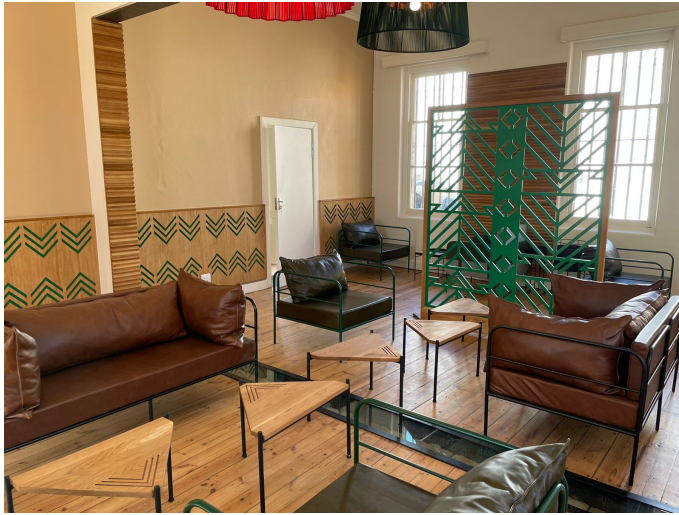
Figure 18 Event room looking Southeast