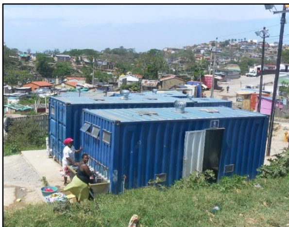
Figure 1: An example of the prefabricated toilets to be constructed within the uMlazi E Informal Settlement.

The proposed sanitation infrastructure will be located within the uMlazi Informal Settlement (uMlazi E) east of Sibusiso Mdakane Drive. Proposed infrastructure lies adjacent to the Fongozi River and floodplain. The Fongozi River is a “largely modified” tributary to the uMlazi River.